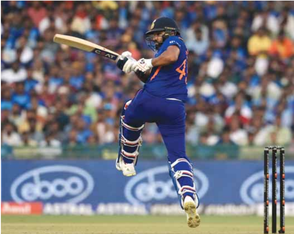
India's captain Rohit Sharma plays a shot during the second ODI against New Zealand at the Shaheed Veer Narayan Singh International Cricket Stadium in Raipur yesterday.

‘You expect that kind of bowling outside India. These guys have got a lot of skills, they have been working on that for all this while and you could see the reward’