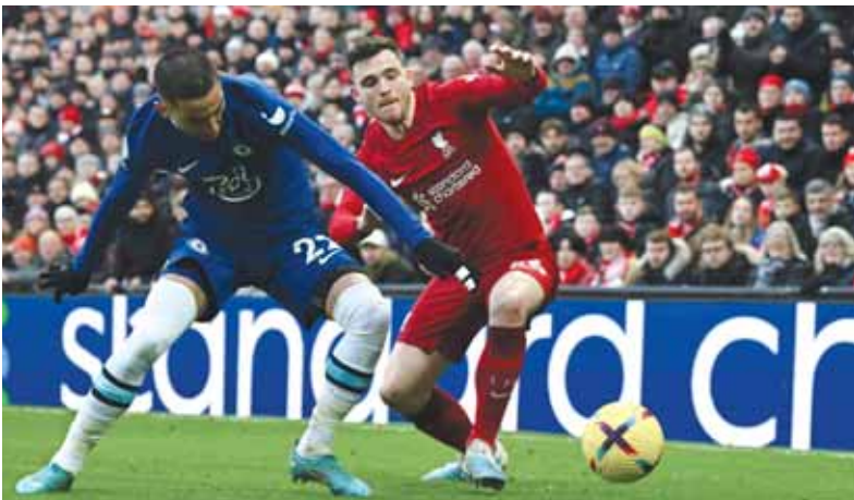
Chelsea's Hakim Ziyech (left) vies for the ball with Liverpool's Andrew Robertson during the Premier League match at Anfield in Liverpool yesterday.

At the other end of the table, Everton's 69-year stay in the top flight looks ever more precarious. Jarrod Bowen struck twice in the first half as West Ham won 2-0 at the London Stadium to move out of the bottom three thanks to their first win in eight league games.