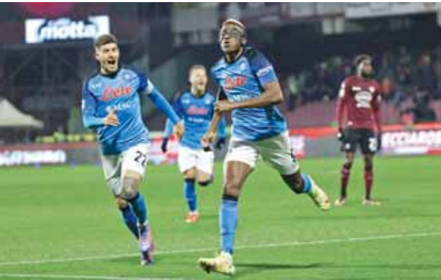
Napoli’s Victor Osimhen (right) celebrates with Giovanni Di Lorenzo after scoring against Salernitana during the Serie A match in Salerno, Italy, yesterday.

seven matches and sit 16th on 18 points, six in front of Verona who are just inside the relegation zone after beating Lecce 2-0 earlier on Saturday to continue their recovery under new coach Marco Zaffaroni. The hosts were also playing under a new manager of sorts as Davide Nicola took his place on the bench at the Stadio Arechi after being sacked on Monday and then brought back in less than 48 hours later. Nicola’s team huffed and puffed but once Di Lorenzo broke their resistance with a precision finish from Andre-Frank Zambo Anguissa’s low pass in first-half stoppage time there was only going to be one winner. Napoli made the short trip to Salerno without Khvicha Kvaratskhelia who usually flanks Osimhen, but the Nigeria forward is in unstoppable form and netted his league-leading 13th of the season two minutes after the break. Kvaratskhelia’s replacement Eljif Elmas cut inside and then let off a low shot which bounce back off the post and straight to Osimhen, who gobbled up the chance to double Napoli’s lead. Napoli had one scare with seven minutes remaining when Alex Meret did superbly well to tip Krzysztof Piatek’s low drive onto the post, and that save made sure of a potentially huge three points for a team who are seemingly having everything their way.