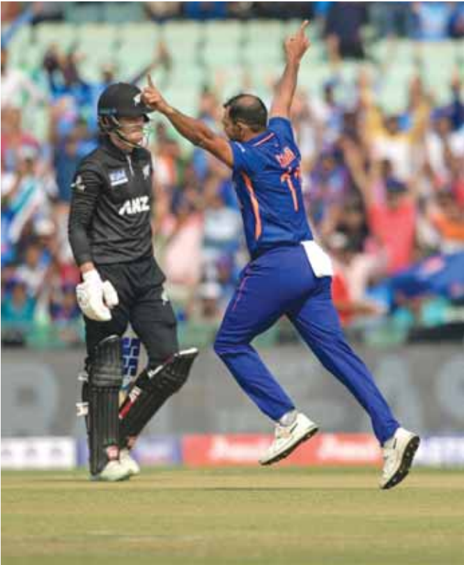
New Zealand's Finn Allen (left) walks back to the pavilion after his dismissal by India's Mohamed Shami yesterday.

man of the match Shami. "As a new-ball bowler, it's important to assess the conditions and pass the message quickly to the other bowlers as well." Glenn Phillips made 36 as he combined with the middle- and lower-order batsmen including Michael Bracewell (22) and Mitchell Santner (27) to take the total past 100, but the innings lasted only 34.3 overs. After Shami's opening-ball heroics, fellow quick Hardik Pandya and spinner Washington Sundar took over to return two wickets each. Shami bowled Finn Allen on the fifth ball of the first over, at a venue making its international debut. Siraj sent back Henry Nicholls, caught at slip for two, before Shami and Pandya took two wickets caught-and-bowled to rattle the visitors, whose skipper Tom Latham fell for one.