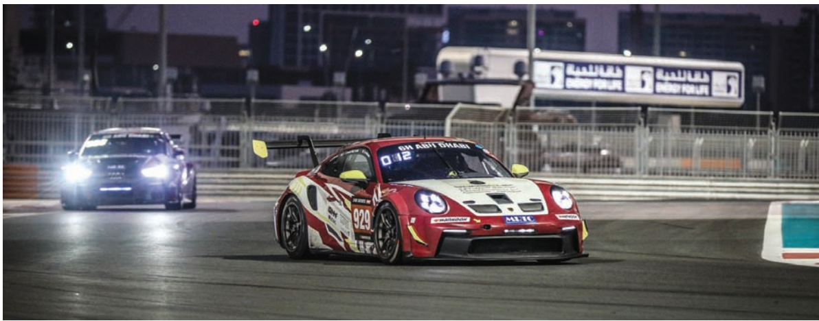
QMMF's Team Thuraya during a practice session for the Abu Dhabi 6H race at the Yas Marina Circuit in Abu Dhabi yesterday.

The Abu Dhabi race – a six-hour endurance contest – is the second round of the 24 Hour Series and it's the third round of the Middle East Endurance championship, following stops in Kuwait (12 hours) and the Dubai (24 hours) endurance races. The 992 class in the Middle East Trophy series is currently led by Willi Motorsport by Ebimotors (60 points) with NKPP by HRT Performance (50) in the second spot, while