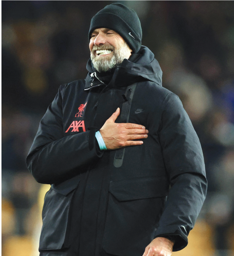
Liverpool manager Jurgen Klopp.

Alex Ferguson knows all about longevity at one of the Premier League’s superpowers. Ferguson, who spent 27 years at United, paid tribute to Klopp’s 1,000-match milestone in his role as League Managers’ Association committee member. “Jurgen is undoubtedly one of the most gifted managers in world football and the dedication and passion which Jurgen brings to his role is inspiring to anyone aspiring to a career in football management,” he said. “The many trophies he has already won in his career, including in recent seasons the Champions League and Premier League with