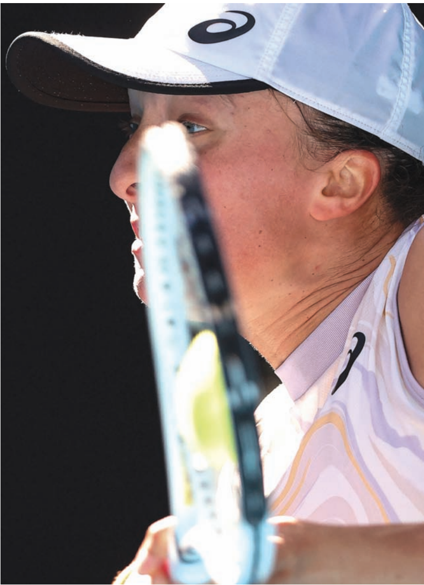
Poland’s Iga Swiatek hits a return against Spain’s Cristina Bucsa during their singles match on day five of the Australian Open in Melbourne yesterday.

Italian Jannik Sinner came from two sets down to beat Marton Fucsovics 4-6 4-6 6-1 6-2 6-0, while Czech Jiri Lehecka took five sets to upset British 11th seed Cameron Norrie 6-7 6-3 3-6 6-1 6-4. Sixth seed Felix Auger Aliassime also advanced with a 6-1 3-6 6-1 6-4 win over Francisco Cerundolo but his fellow Canadian Denis Shapovalov came up short in a stirring comeback against 10th seed Hubert Hurkacz and bowed out 7-6(3) 6-4 1-6 4-6 6-3.