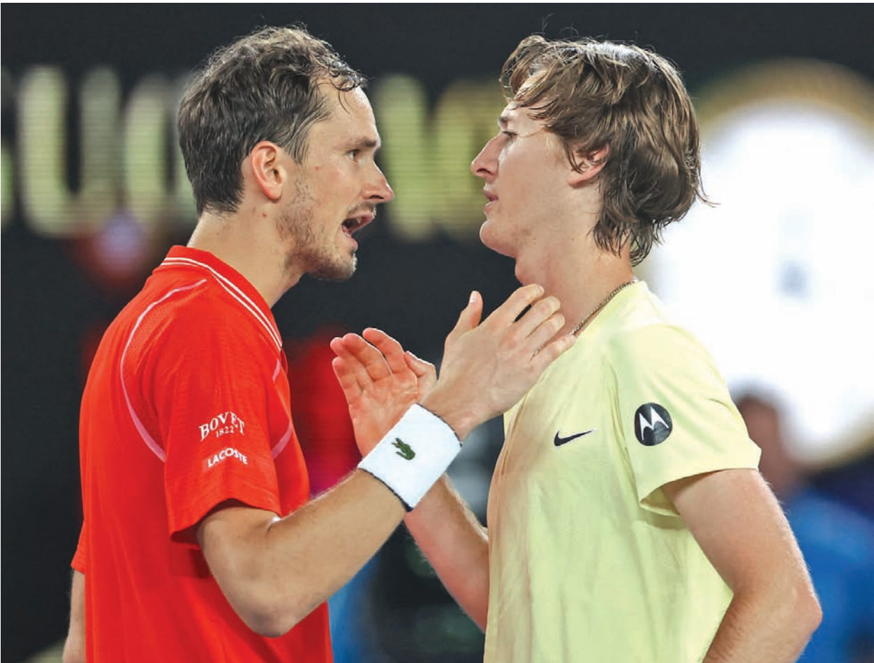
Sebastian Korda of the US shakes hands with Russia’s Daniil Medvedev after winning his third round match at Melbourne Park, Melbourne, Australia, yesterday.