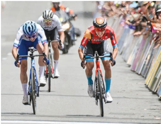
Spanish rider Pello Bilbao from Bahrain Victorious team (right) beats English cyclist Simon Yates from Team Jayco-AlUla to win stage three of the Tour Down Under - a UCI cycling event - near Adelaide yesterday.

After Friday’s series of climbs, the penultimate stage on Saturday from Port Willunga to Willunga Township over 133.2km will be one for the sprinters.