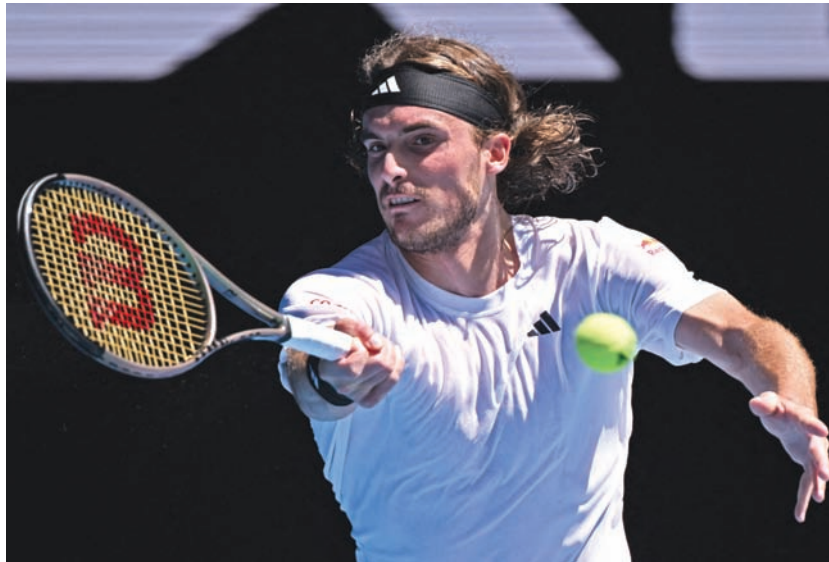
Greece’s Stefanos Tsitsipas hits a forehand return against Netherlands’ Tallon Griekspoor during their singles match on day five of the Australian Open in Melbourne yesterday.

Azarenka will next play world number 87 Zhu Lin of China, who stunned Greek sixth seed Maria Sakkari 7-6(3) 1-6 6-4 in the final match of the day.