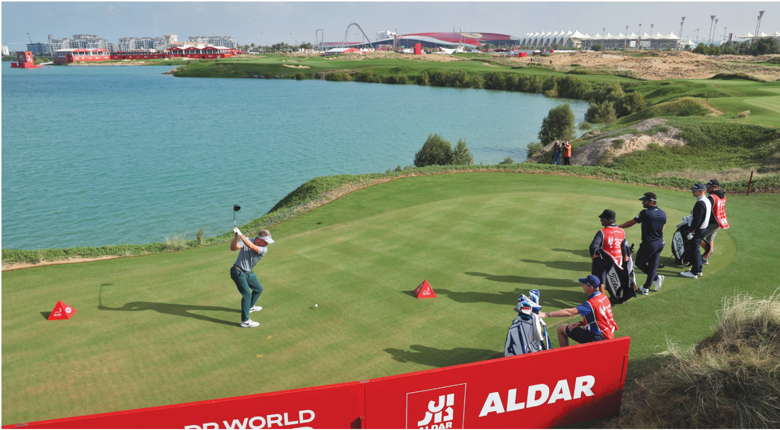
A player tees off at the Yas Links Golf Course on day two of the HSBC Abu Dhabi Golf Championships yesterday.

Molinari, who captained him at the Hero Cup, over the weekend. He added: “I was watching the leaderboard and I saw the Captain right there on top, Francesco Molinari. It’s