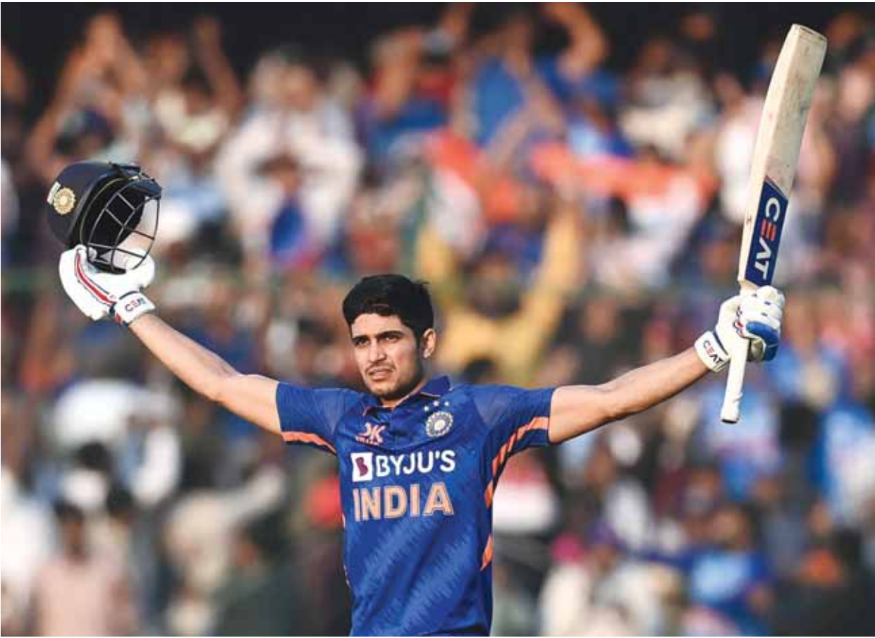
India's Shubman Gill celebrates after scoring a double century (200 runs) during the first one-day international (ODI) against New Zealand at the Rajiv Gandhi International Cricket Stadium in Hyderabad yesterday. Below: New Zealand's Michael Bracewell reacts during the first ODI against India yesterday.

India captain Sharma said Bracewell threatened to take the game away from India's grasp with his daredevil batting.