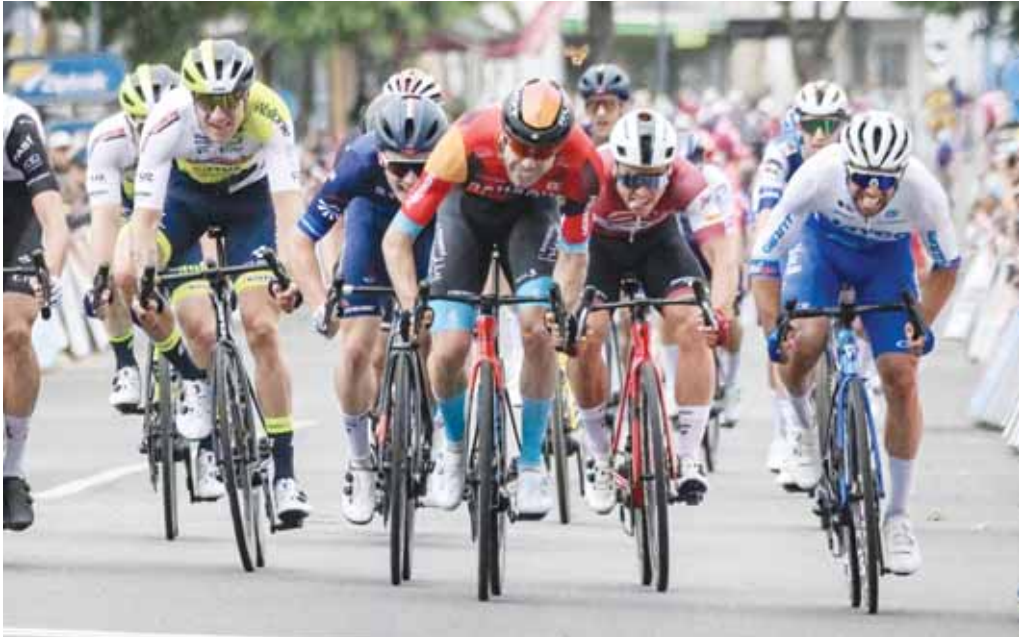
German cyclist Phil Bauhaus (centre) from Bahrain Victorious team sprints to the finish to win stage one of the Tour Down Under - a UCI cycling event - in Adelaide yesterday.

The stage was marred by a series of pile-ups and a few riders came down in a scrimmage in the closing furious kilometre.