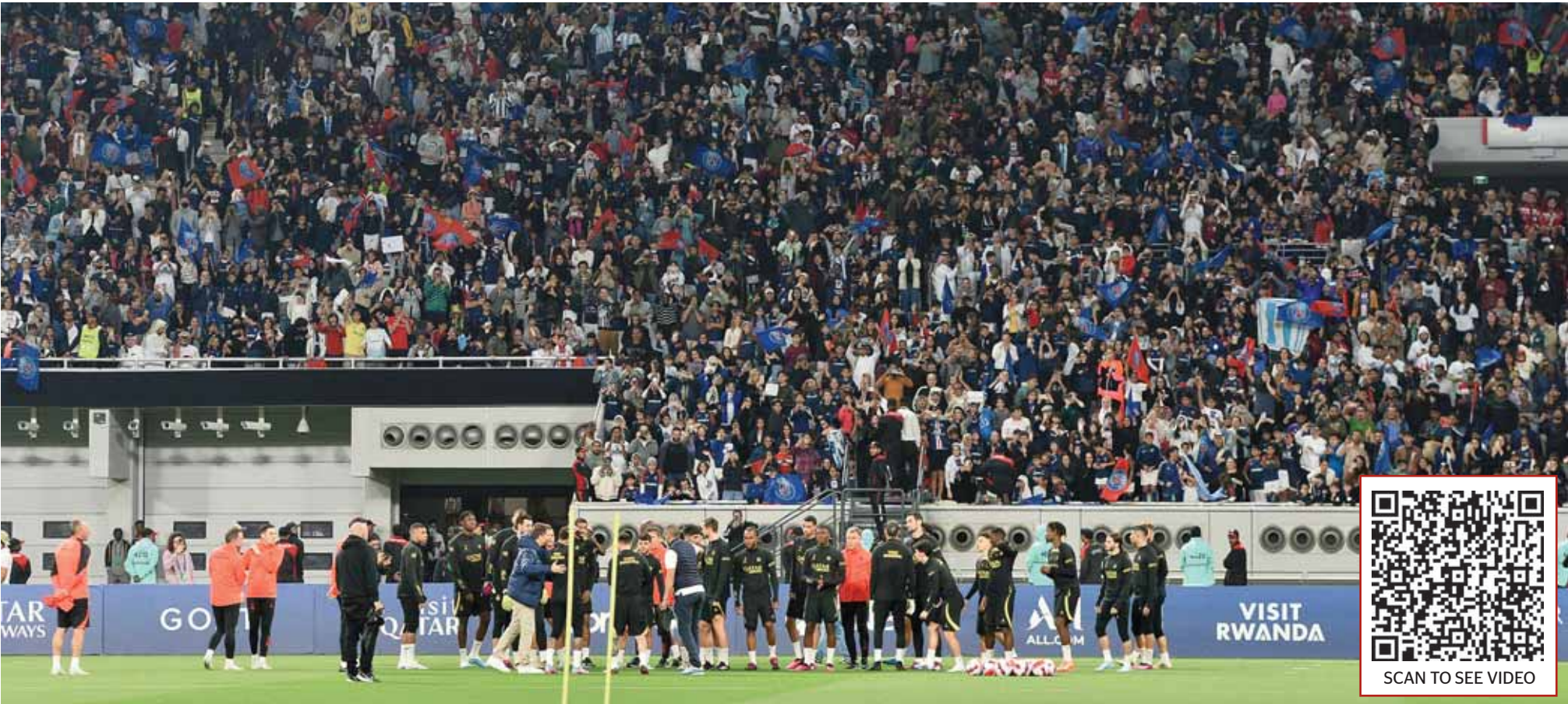
Paris Saint-Germain players train in front of 30,000 passionate fans at the Khalifa International Stadium yesterday during their promotional tour to Qatar.