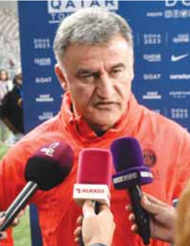
PSG coach Christophe Galtier speaks to reporters yesterday.

match against (sixth-division minnows) Pays de Cassel both to find rhythm on an individual level and more coherence on a collective level. As a team we have to perform like we did in the first half of the season. We have struggled after the resumption of the league," said Galtier.