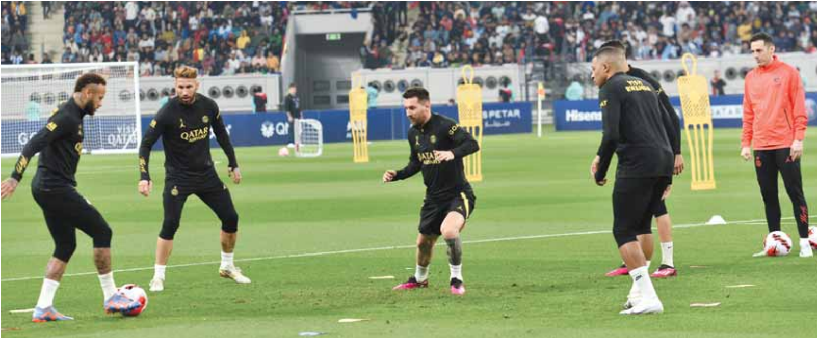
Paris Saint-Germain's Argentine forward Lionel Messi (centre) trains with teammates Neymar, Sergio Ramos and Kylian Mbappe at the Khalifa International Stadium.