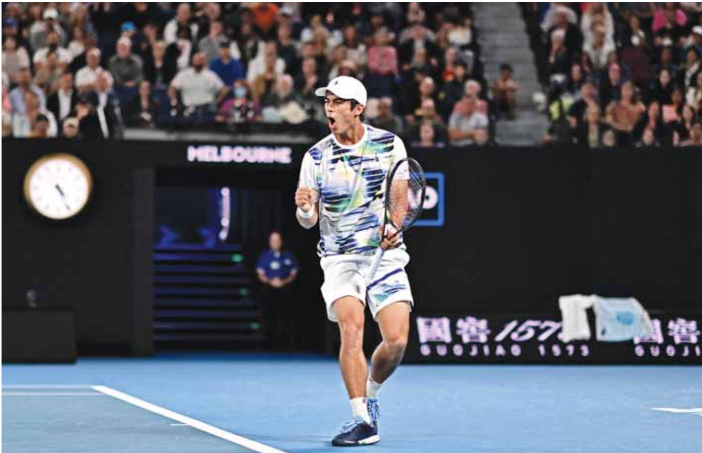
Mackenzie McDonald of the US reacts on a point against Spain's Rafael Nadal during their singles match on day three of the Australian Open in Melbourne yesterday. Right: Spain's Rafael Nadal gets medical attention during the break in the match against McDonald yesterday.

Another shock appeared set to rock Melbourne Park when Felix Auger-Aliassime went two sets down against Alex Molcan at Margaret Court Arena but the Canadian sixth seed rallied to close out the match 3-6 3-6 6-3 6-2 6-2.