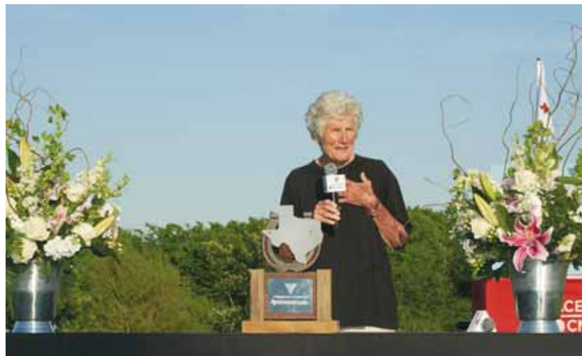
In this file photo taken on May 6, 2018, Kathy Whitworth speaks at the trophy presentation following the 2018 Volunteers of America LPGA Texas Classic at Old American Golf Club in The Colony, Texas. Whitworth, the most successful LPGA golfer with a record 88 titles, has died at the age of 83.

"Golf just grabbed me by the throat. I can't tell you how much I loved it. I used to think everyone knew what they wanted