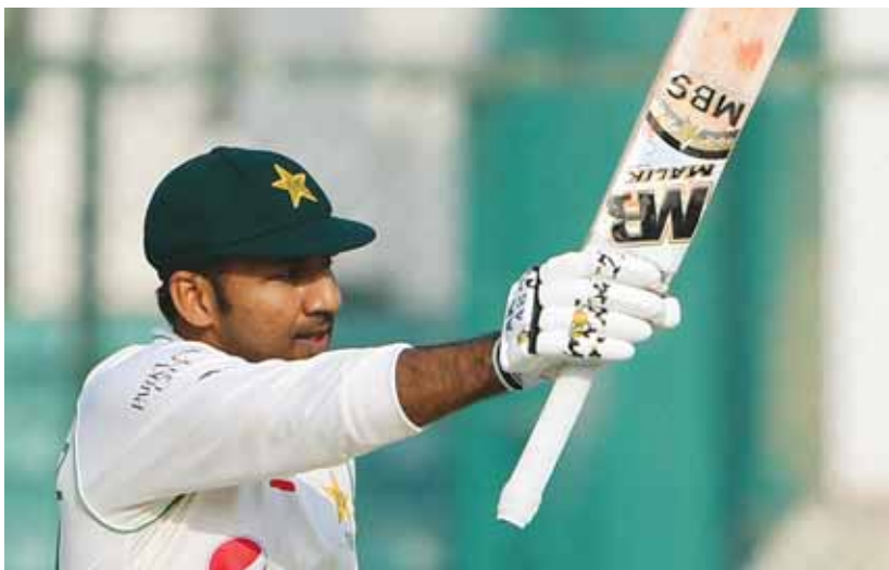
Pakistan's Sarfaraz Ahmed celebrates after scoring a half-century during the first day of the first Test against New Zealand.

In the penultimate over before lunch, fast bowler Tim Southee dismissed Saud Shakeel for 22 to complete a successful session for the tourists, playing their first Test series in Pakistan since 2002.