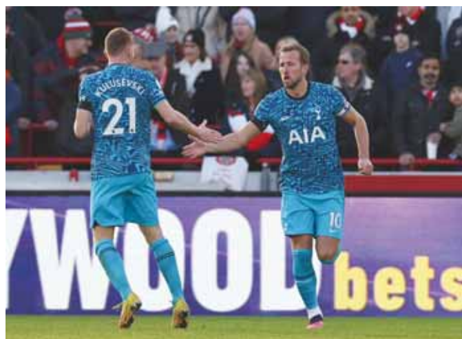
Tottenham Hotspur's Harry Kane celebrates scoring their first goal with Dejan Kulusevski against Brentford in London yesterday.

table, four points ahead of fifth-placed Manchester United in the race to qualify for the Champions League.