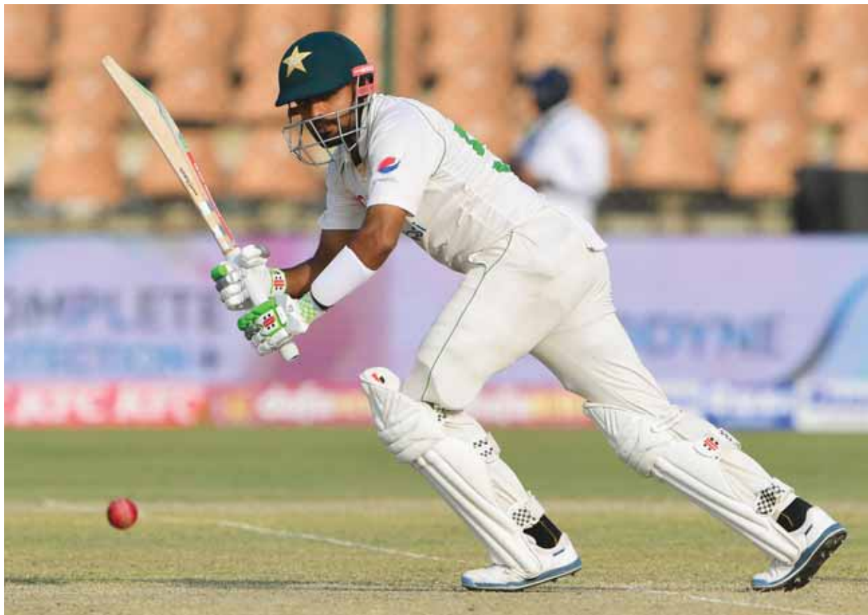
Pakistan's captain Babar Azam plays a shot during the first day of the first Test against New Zealand at the National Stadium in Karachi yesterday.

New Zealand's spinners dominated the first session, with Bracewell dismissing Shan Masood for three and Imam-ul-Haq for 24, while Patel took the early wicket of Abdullah Shafique for seven.