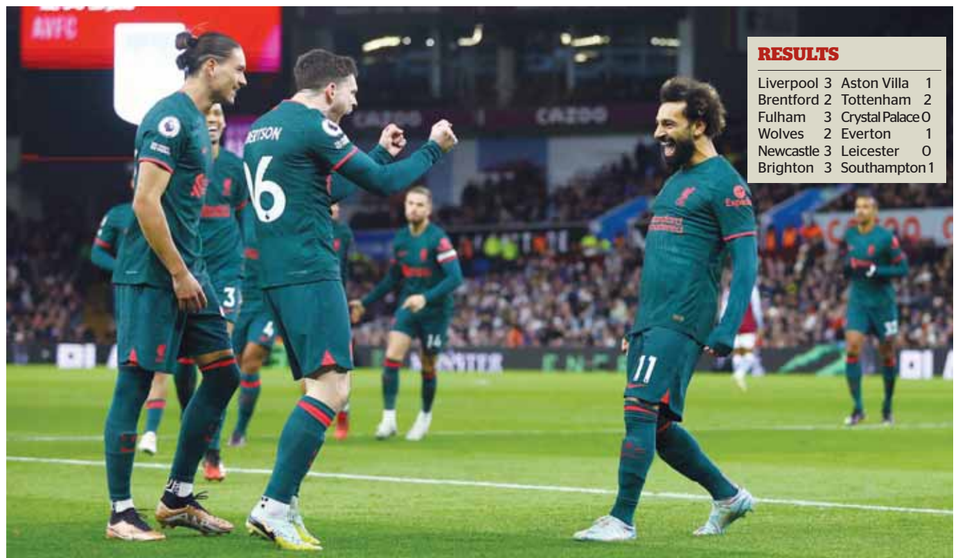
Liverpool's Mohamed Salah (right) celebrates with teammates after scoring his team's first goal during the English Premier League match against Aston Villa in Birmingham yesterday.

Arsenal can extend their advantage at the top when they