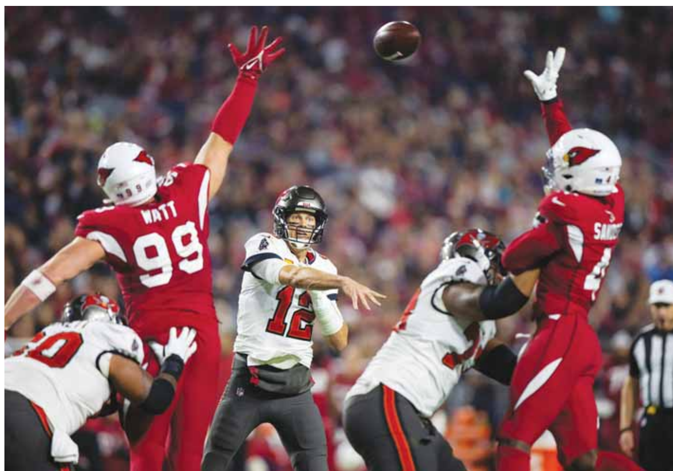
Tampa Bay Buccaneers quarterback Tom Brady (12) throws a pass against the Arizona Cardinals at State Farm Stadium in Glendale, Arizona, USA.

Cam Akers carried 23 times for 118 yards and three touchdowns while Baker Mayfield completed 24 of 28 passes for 230 yards and two touchdowns for the Rams, who had four interceptions in the