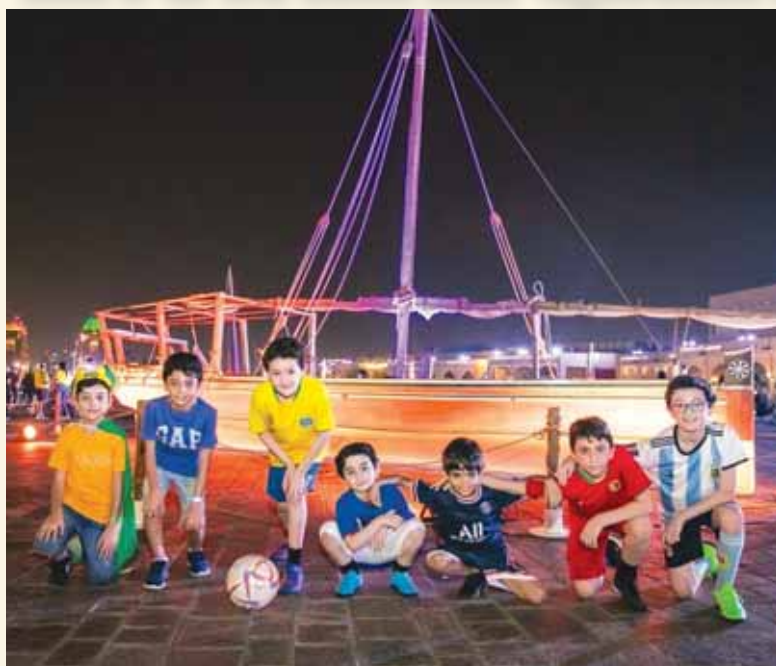
Young fans at Katara.

Located next to Al Wakra Metro Station, 12 minutes from Doha. Access: Event admission ticket required. 20% discount on your first ticket