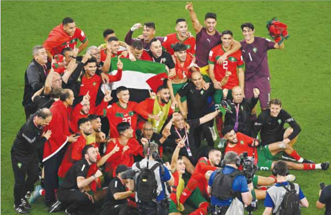
Morocco's players celebrate at the end of the Qatar 2022 World Cup round of 16 football match between Morocco and Spain at the Education City Stadium yesterday.

It was a huge blow for Luis Enrique's team, who arrived in Qatar as one of the favourites after reaching the Euro 2020 semi-finals and the Nations League final last year.