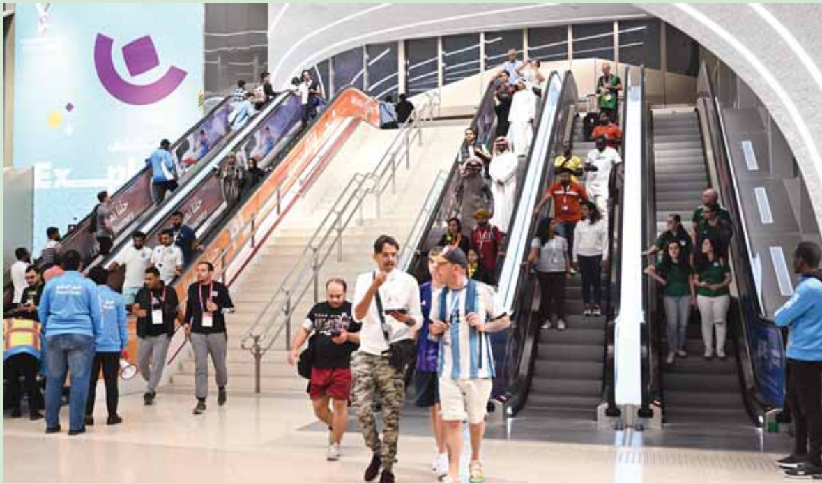
Doha Metro staff are being praised for their outstanding service.