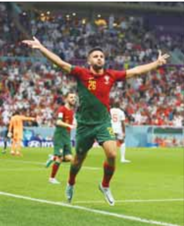
Portugal's Goncalo Ramos celebrates scoring their fifth goal and his hat-trick in the match against Switzerland at the Lusail Stadium yesterday.

"We completely dominated the match, it's a shame it went that way," the Spain coach told TVE yesterday. "It's the most difficult thing, playing against a team like Morocco who are hard workers. The penalties cost us, but I am very proud of the team and all the players. I'm very sorry about the result but I congratulate Morocco."