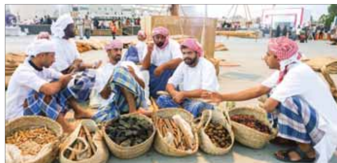
Glimpses from the activities taking place at Katara, which are attracting visitors from around the world.

Further, the visitors to Katara watch daily, starting at 3.30pm, a military show presented by the Military Show Centre and the Qatari Armed Forces Music Battalion on the Katara waterfront.