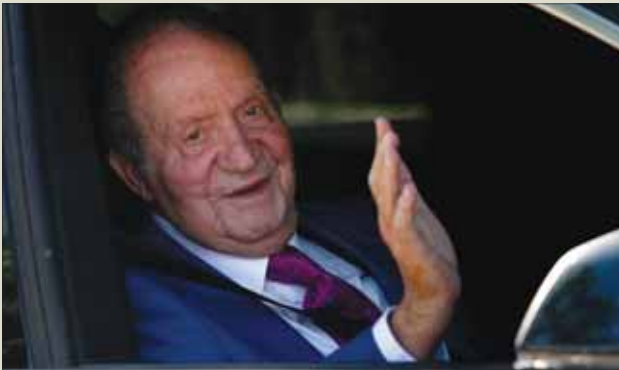
In this file photo taken on May 23, 2022 former king Juan Carlos I of Spain, waves from a car as he arrives at La Zarzuela palace in Madrid, to meet with his son, King Felipe VI of Spain.

Russia's invasion and its decision to conscript hundreds of thousands of men has set off an exodus of Russians from the country, including critical politicians and journalists.