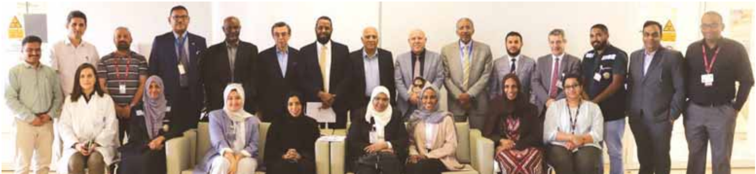
The MoPH is partnering with the US CDC for field epidemiology training programme in Qatar.