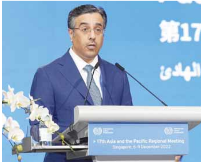
HE the Minister of Labour Dr Ali bin Smaikh al-Marri addressing the gathering.

He stressed that there are new legislation enacted to increase the protection of workers from heat stress, raise awareness of occupational safety and health, update the inspection policy by training labour inspectors, as well as raise awareness among domestic labourers, amplify the voice of labourers and encourage social dialogue, implement digital government initiatives, combat trafficking and forced labour, as well as the creation of a safe and balanced work environment in accordance with the standards of the ILO. HE the Minister revealed that Qatar will host next March, the 5th UN Conference for the Least Developed Countries, to meet the needs and priorities of these countries and contribute to supporting their path towards achieving development in line with the 2030 Agenda for Sustainable Development. He also participated in the high-level session along with