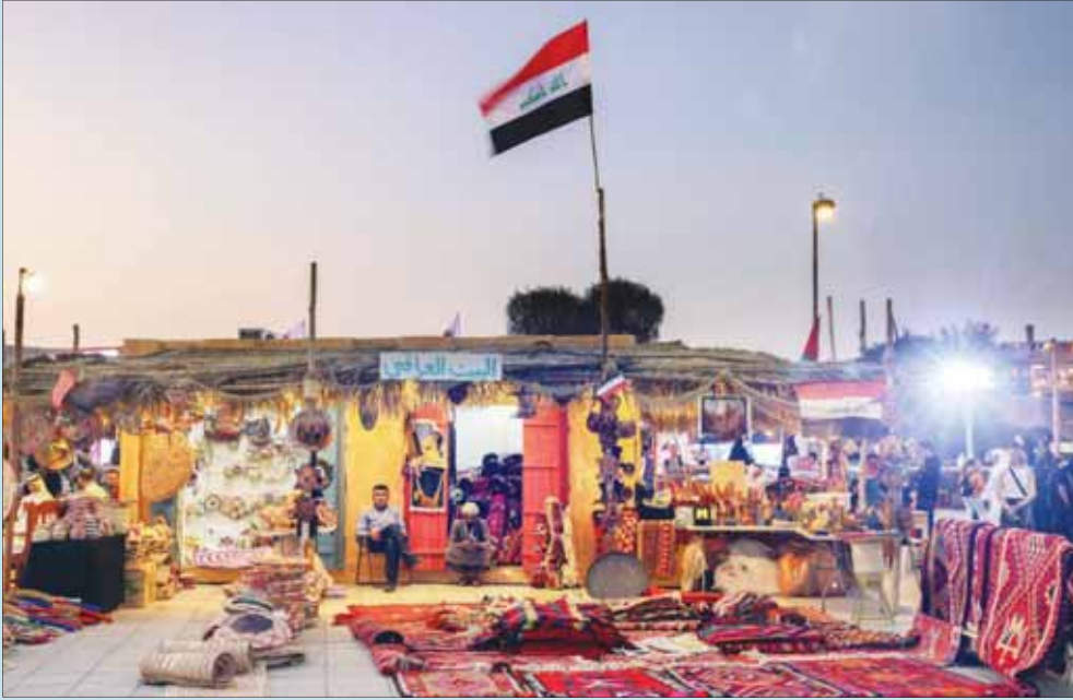
Katara is buzzing with activity thanks to its multiple attractions.