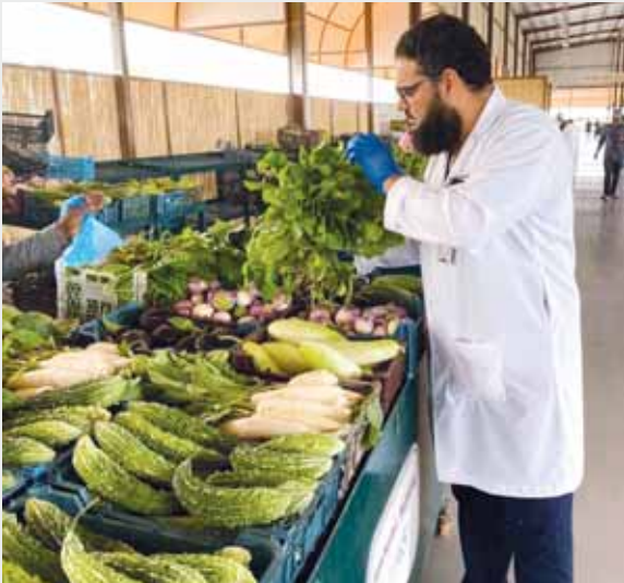
Umm Salal Municipality's health control section has carried out an inspection campaign at the Central Market there for three days to ensure compliance with the ministerial decision on regulating the use of plastic bags and the ban on single-use plastic bags. Besides, the campaign aimed at raising awareness about food health and safety regulations and standards.