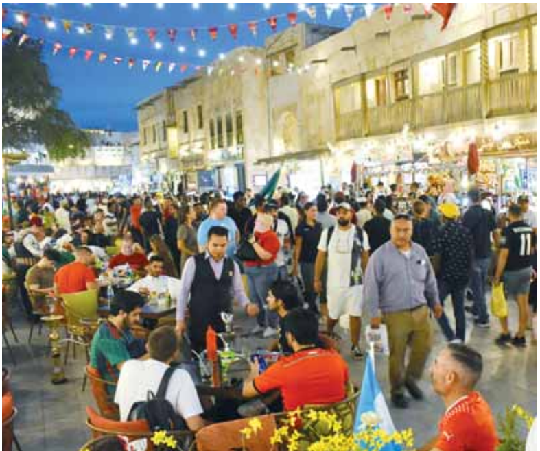
Busy eateries at Souq Waqif.

He said that the shops and commercial outlets are in line with the State's directions and strategy aimed at hosting the first carbon-neutral edition of the World Cup, as all shops committed to using paper cups and utensils that can be recycled, which reinforces the country's plans to establish global standards in preserving the environment, to serve as a role model in the major world championships, in addition to building a sustainable legacy that benefits future generations.