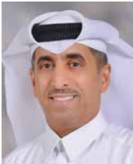
HE Dr Ibrahim bin Saleh al-Nuaimi

Dr al-Nuaimi stressed the strong impact of teachers' role in education and in improving its quality as they play a crucial role in the success of reform and