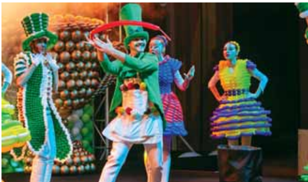
A show at Katara.