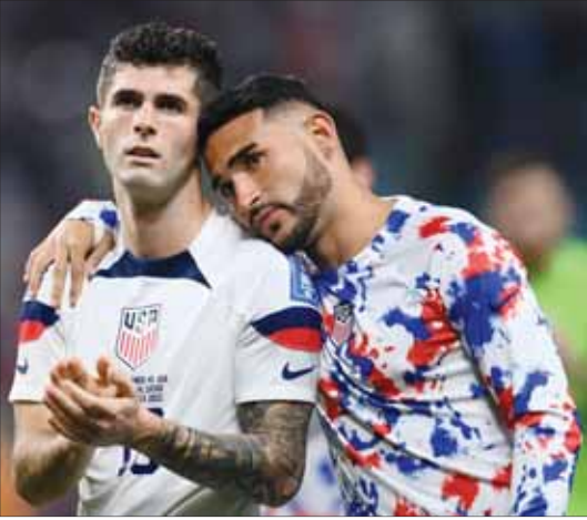
Christian Pulisic and Cristian Roldan of the US look dejected after the match against the Netherlands.