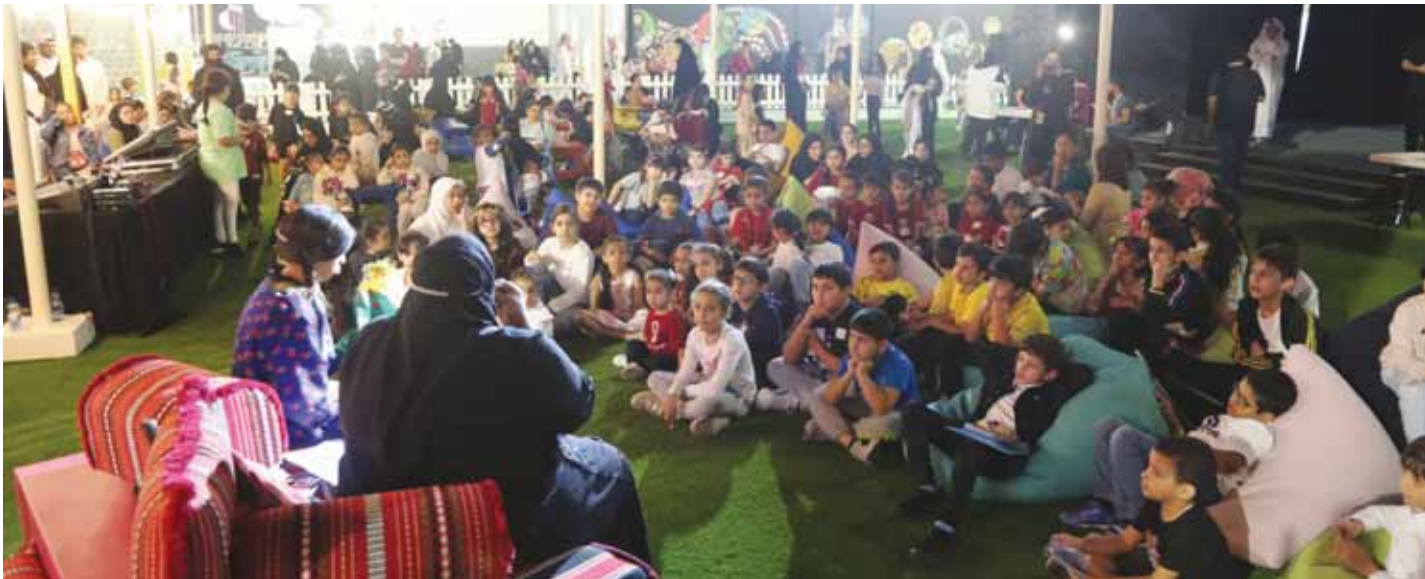
Children are taking part in various activities held at Darb Al Saai, aimed at encouraging them to read and write, and enrich their knowledge and skills, with various books that cover topics such as the history of Qatar, Qatar National Day, and the FIFA World Cup Qatar 2022.