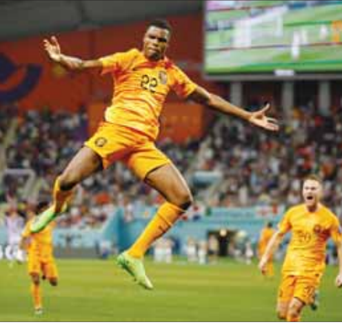
The Netherlands’ Denzel Dumfries celebrates scoring their third goal against the US.

The Safety & Security Operations Committee (SSOC) of the FIFA World Cup Qatar 2022 has advised people not to travel to stadiums hosting World Cup matches without valid tickets. “All attendees at FIFA World Cup Qatar 2022 matches are required to hold the appropriate ticket. Please do not travel to stadiums without holding a valid match ticket,” the SSOC said in a statement yesterday. “Instances of fans attempting to gain access to stadiums without holding the correct ticket are taken seriously by our security teams and will be dealt with accordingly,” the statement noted.