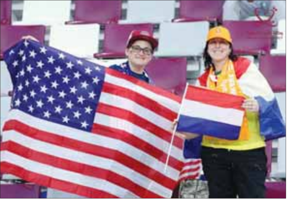
Female fans at the Netherlands vs USA match at Khalifa International Stadium yesterday.

teacher explained that he had come to Qatar to care for his daughter but admitted that he had discovered that he did not need to do so because of what he found in this country.