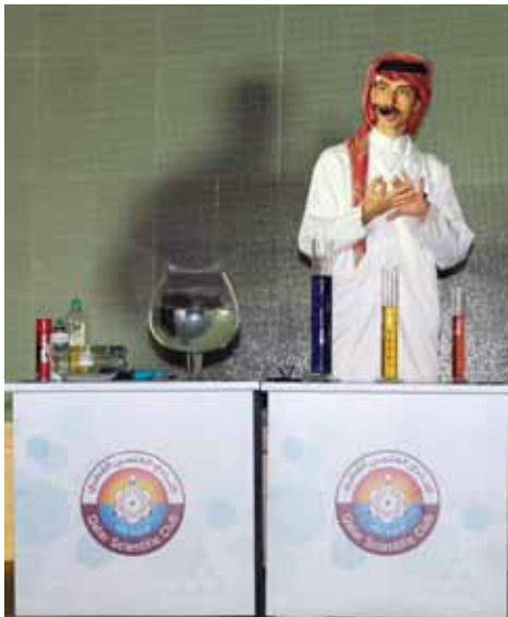
The QSC will offer a range of shows at Darb Al Saai.

The National Day also emphasises the identity of the state and its history, and embodies the ide-