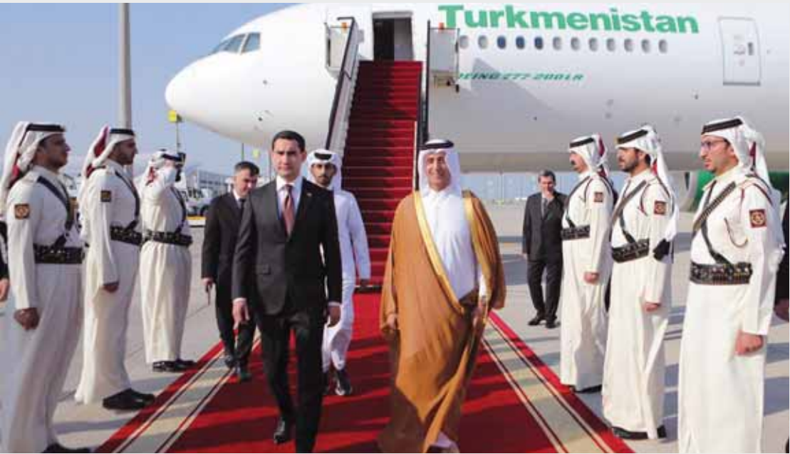
Turkmenistan President Serdar Berdimuhamedov arrived in Doha yesterday to attend part of the FIFA World Cup Qatar 2022 matches. He and the accompanying delegation were received upon arrival at Hamad International Airport by HE the Minister of State Sheikh Fahd bin Faisal al-Thani.