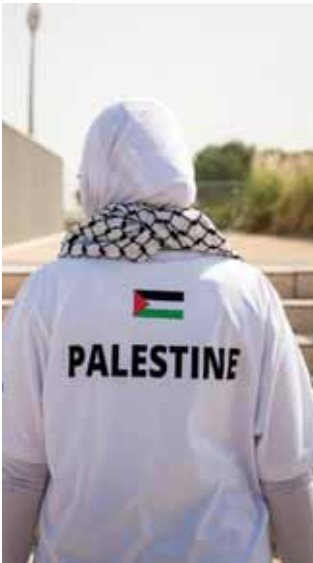
in locations including Gaza with the aim of sparking dialogue on key global issues.

During the FIFA World Cup Qatar 2022, the Doha Debates Portal has been part of the FIFA Fan Festival in Doha, connecting fans and visitors with people