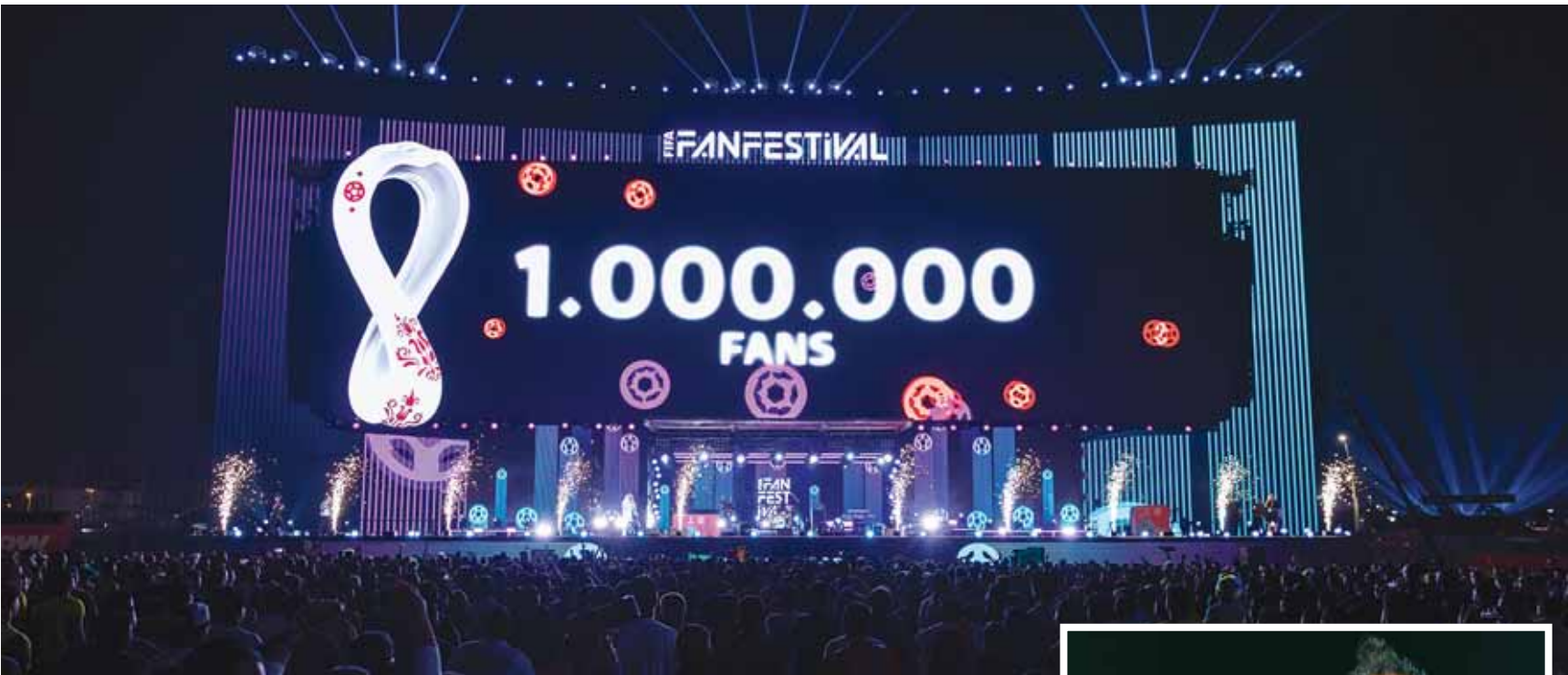
Marking the one millionth visitor milestone.

☞ World Cup activations/celebrations at Katara – the Cultural Village, Souq Waqif and Msheireb Downtown Doha, plus Katara Traditional Dhow Festival and more. Please refer to https://www.qatar2022.qa/en/live-it-all-in-qatar for more information.