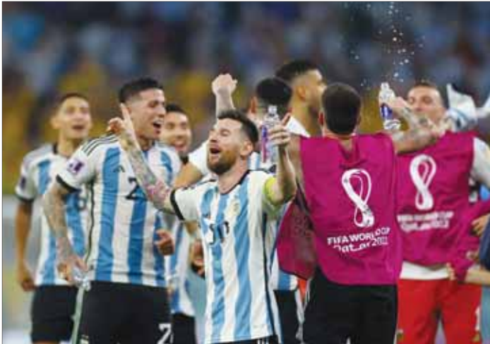
Lionel Messi celebrates after the match against Australia.

Australia, who did superbly to reach the last 16 and are ranked 35 places below the double World Cup winners, defended valiantly with the towering Harry Souttar prominent. They set up a nervy