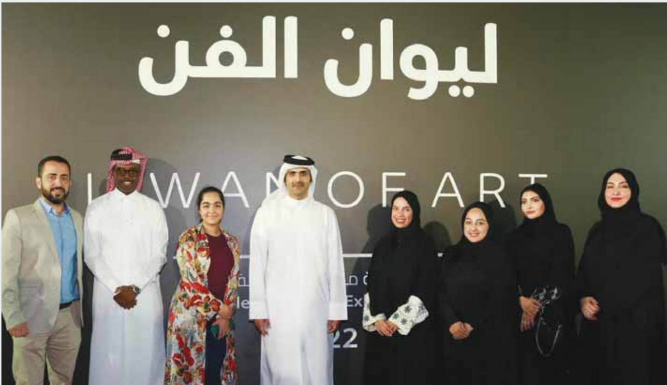
HE the Minister of Culture Sheikh Abdulrahman bin Hamad al-Thani, Chairman of the Organising Committee of the National Day Celebrations, toured an arts exhibition at Darb Al Saai yesterday. He also met some of the artists there and listened to detailed presentations about their paintings, Arabic calligraphy, Islamic decoration, and pottery.