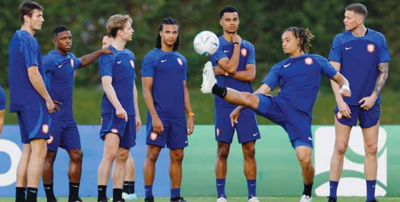
Netherlands' Frenkie de Jong, Cody Gakpo, Nathan Ake, Tyrell Malacia, Xavi Simons and Wout Weghorst during training in Doha yesterday.

Netherlands will not underestimate the United States when they meet in the World Cup last 16 this weekend, manager Louis van Gaal told a media conference yesterday that had almost as many questions about his future as it did about the knockout clash. Van Gaal described today’s opponents as very strong, while reporters from neighbouring Belgium made overtures for the combative coach to take over their national team after Roberto Martinez stepped down following Belgium’s exit on Thursday. “You’ve got to convince my wife,” he told the Belgians, which prompted a follow-up question from an African reporter about whether or not he would be prepared to move there. “I don’t think so but you’ve got to keep your options open,” Van Gaal joked, before getting back to the business in hand. “The USA has demonstrated that it has an excellent team, I would even say one of the best teams, a team that is fine-tuned (but) it’s nothing we can’t overcome,” Van Gaal added ahead of the game at the Khalifa International Stadium. “The USA that is a very energetic squad, they have physically strong players and that is tough for any opponent, and you can tell from their results, but we will do everything we can to win and to beat USA, that’s it.” The Dutch made it through by winning Group A with Senegal joining them in the last 16 as runners-up, but Van Gaal’s side have failed to impress so far, with the exception of forward Cody Gakpo, who netted three goals in their three group games.