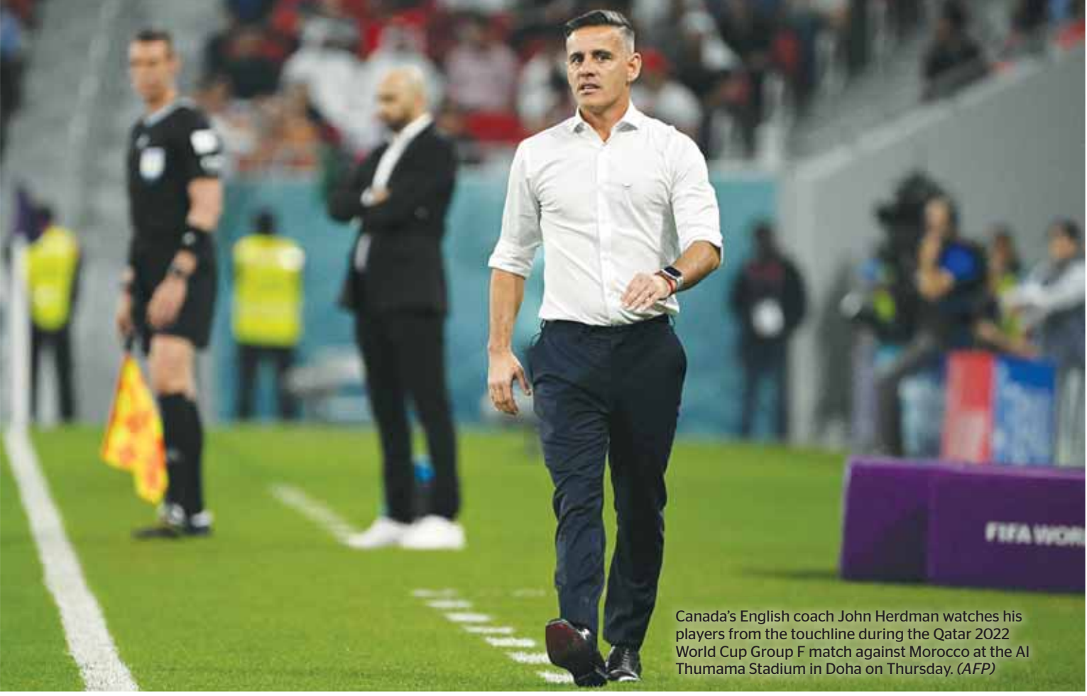
Canada's English coach John Herdman watches his players from the touchline during the Qatar 2022 World Cup Group F match against Morocco at the Al Thumama Stadium in Doha on Thursday.

deep breath and enjoy what we have experienced here and ask the hard questions because that is part of growth as we move through to 2026. "This isn't Canada walking away with our heads down, we can keep our heads up." MASSIVE STEP UP After finishing top of CONCACAF qualifying ahead of regional powerhouses the United States and Mexico, Canada discovered there is a massive step up in class and quality at a World Cup. At times Canada, while playing with boundless energy, appeared overwhelmed on the pitch and off it, fumbling routine tasks like showing up on time for news conferences. Herdman was also tripped up by his own words, claiming after the 1-0 loss to Belgium that Canada was going to defeat Croatia. A few days later Croatia provided Herdman with their response, a 4-1 thrashing. Canada produced another exuberant performance against Morocco but again could not deliver the result they came for. "When you talk about that opportunity to grow through a tournament that's part of it," said Herdman. "This is the first time we have been here in 36 years. "We've enjoyed the ride. Our players turned up here to compete and we showed that we've been fearless over each of the three games. "We're a young team, we're developing, we're here for the first time in a long time. It's been a hell of an experience."