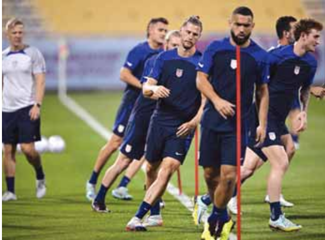
USA's players take part in a training session at Al Gharafa Stadium in Doha on the eve of the Qatar 2022 World Cup match against the Netherlands.

and every game, you have a debate with your players about it. People love to discuss soccer and you really learn a lot. And it was a great time for me. “If I wasn’t in Holland, I don’t think I would have had that background that really helped shape my ideas.” Berhalter is not the only person in the American camp with Dutch experience. Right back Sergino Dest was born to a Dutch mother and Surinamese-American father in Almere, Netherlands and grew up in Holland. Dest, currently at AC Milan on loan from Barcelona, rose to prominence with Dutch giants Ajax and was eligible to represent both US and the Netherlands at international level. “When you’re at a club like Ajax, there’s a lot of attention on you, especially as a young player. It’s a very good club to develop players and he did really well there,” Berhalter said. “He has been fantastic for us this camp. I’m really happy for him and hopefully he has a great game tomorrow.”