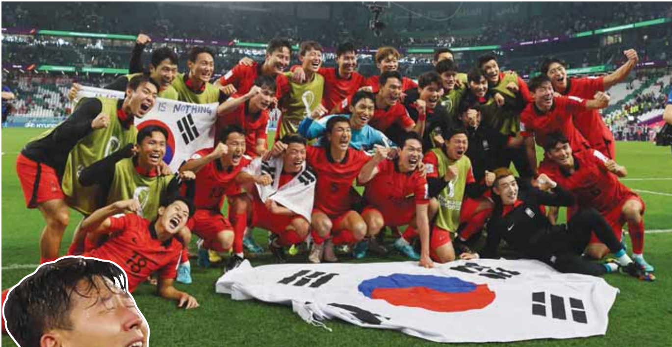
South Korea players celebrate at the Education City Stadium after qualifying for the knockout stages yesterday.

Already-qualified Portugal, the 2016 Euro champions, finished top of the group with 6 points with Cristiano Ronaldo starting the game yesterday despite a big concern over his injury. South Korea and Uruguay ended with 4 points each but the