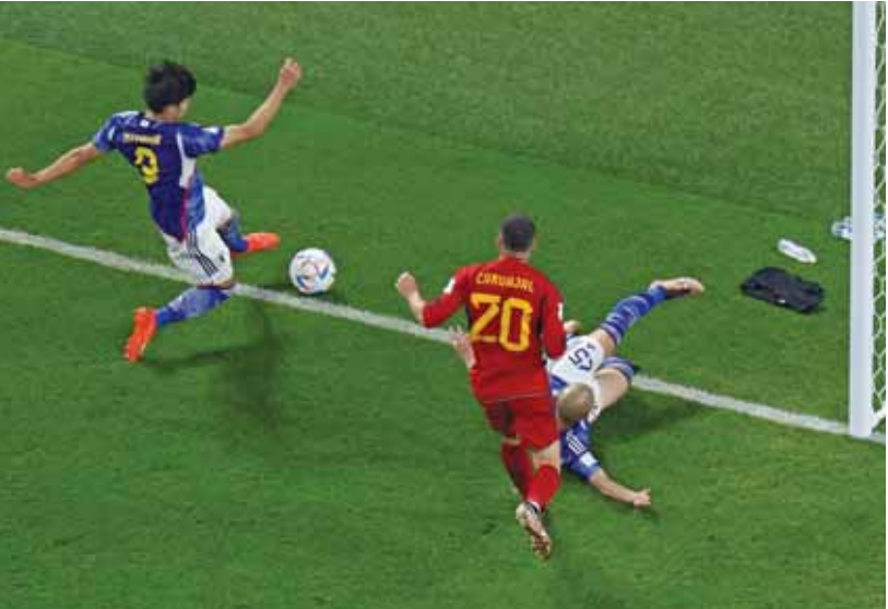
Japan's forward Kaoru Mitoma (left) crosses the ball for his team's second goal during the World Cup Group E match against Spain at the Khalifa International Stadium in Doha on Thursday.