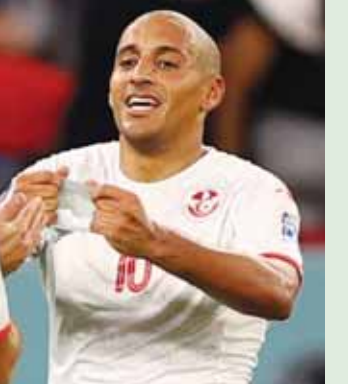
Tunisia's Wahbi Khazri celebrates scoring their first goal during the match against France at the Education National Stadium in Al Rayyan, on Wednesday.

Tunisia striker Wahbi Khazri announced his retirement from international soccer after the national side were eliminated at the group stage of the World Cup in Qatar. Khazri scored to give Tunisia a 1-0 win over holders France on Wednesday, joining Saudi duo Salem al-Dawsari and Sami al-Jaber as the all-time leading Arab scorers at World Cups with three goals each. "After the Tunisia match, and in a meeting that included all the players and the technical and administrative staff, I told everyone that this moment is appropriate, and I thanked everyone and wished them success," Khazri told Bein Sports French. "I am proud of what I gave my country over the past years, and I believe that the future for this generation is bright." The 31-year-old Montpellier striker said: "To beat France, to score and be decisive, that is more beautiful." Tunisia began their World Cup campaign with a goalless draw against Denmark, then