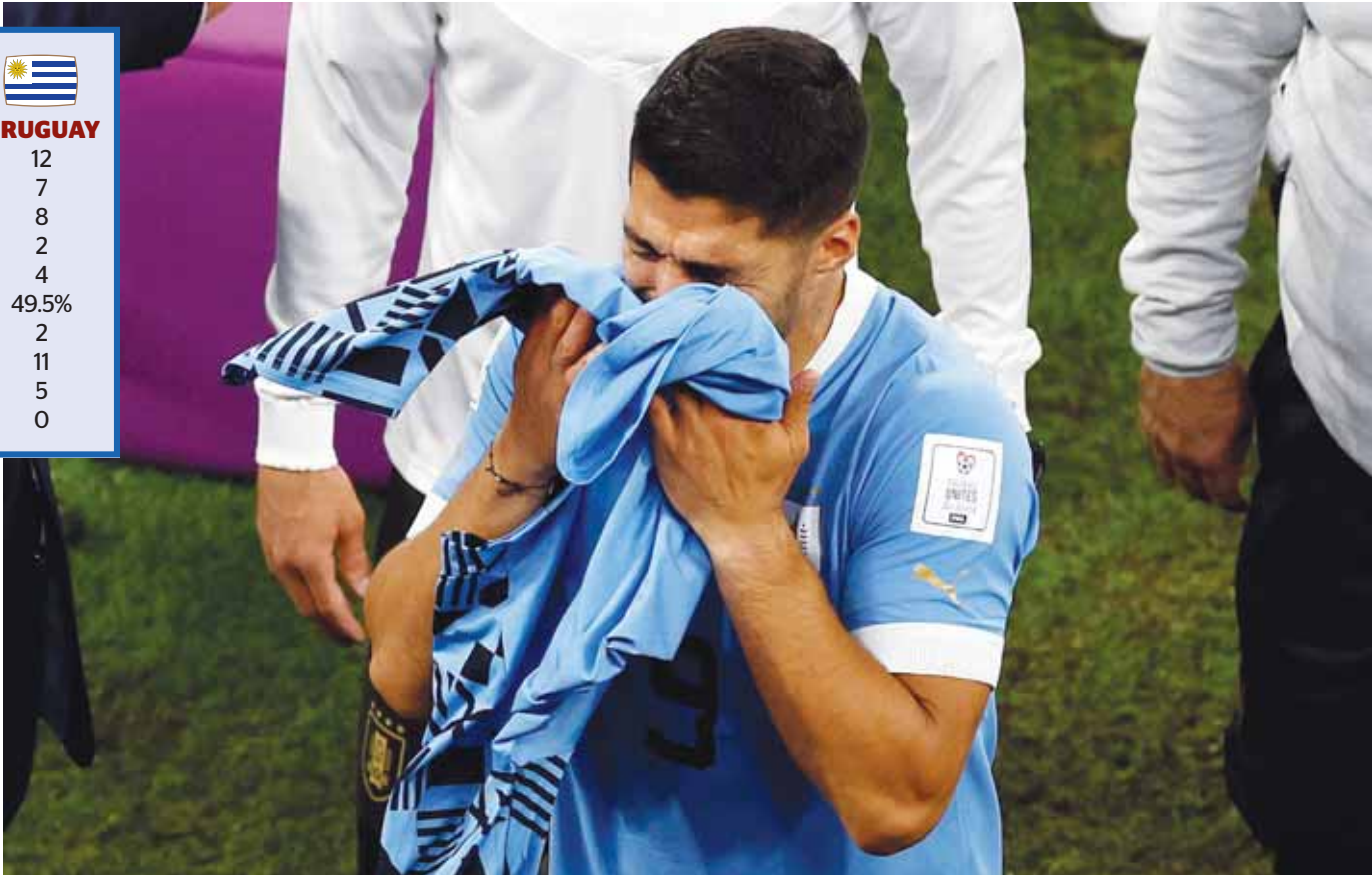
Uruguay's Luis Suarez looks dejected after his team was eliminated from the World Cup in Doha yesterday.