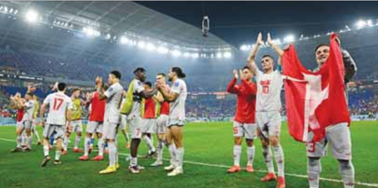
Players of Switzerland celebrate defeating Serbia 3-2 and qualifying to the next round of the tournament, at the end of the Qatar 2022 World Cup Group G football match between Serbia and Switzerland at Stadium 974 in Doha yesterday.

South Korea reached the World Cup knockout phase in dramatic style yesterday, scoring in stoppage time to beat already qualified Portugal and condemn Uruguay to a painful exit. With the clock ticking down at Education City Stadium, the Koreans knew they needed one more goal to leapfrog the South Americans and Hwang Hee-chan delivered to secure a 2-1 victory. The Korean players stood in a huddle watching the final minutes of the Ghana vs Uruguay match on a mobile phone as they waited for their place in the last 16 to be confirmed. Uruguay, leading 2-0, needed one more goal to go through but fell agonisingly short despite piling on the pressure. Uruguay and South Korea ended the group phase level on four points and with an identical goal difference but crucially the Koreans had scored two more goals, which meant they finished second in Group H behind Portugal. Tottenham forward Son Heung-min, who produced a brilliant assist for the winner, said he was crying “tears of happiness”. “We waited really long for this moment and we as players believed altogether we could do this,” he said. “There were moments when I wasn’t