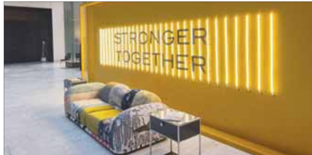
The exhibition demonstrates the capabilities of emerging design talents in Qatar.

port the new generation of designers. We encourage everyone to visit the exhibition and learn more about local Qatari