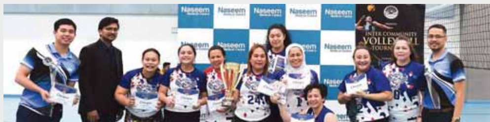
Women's team champion.