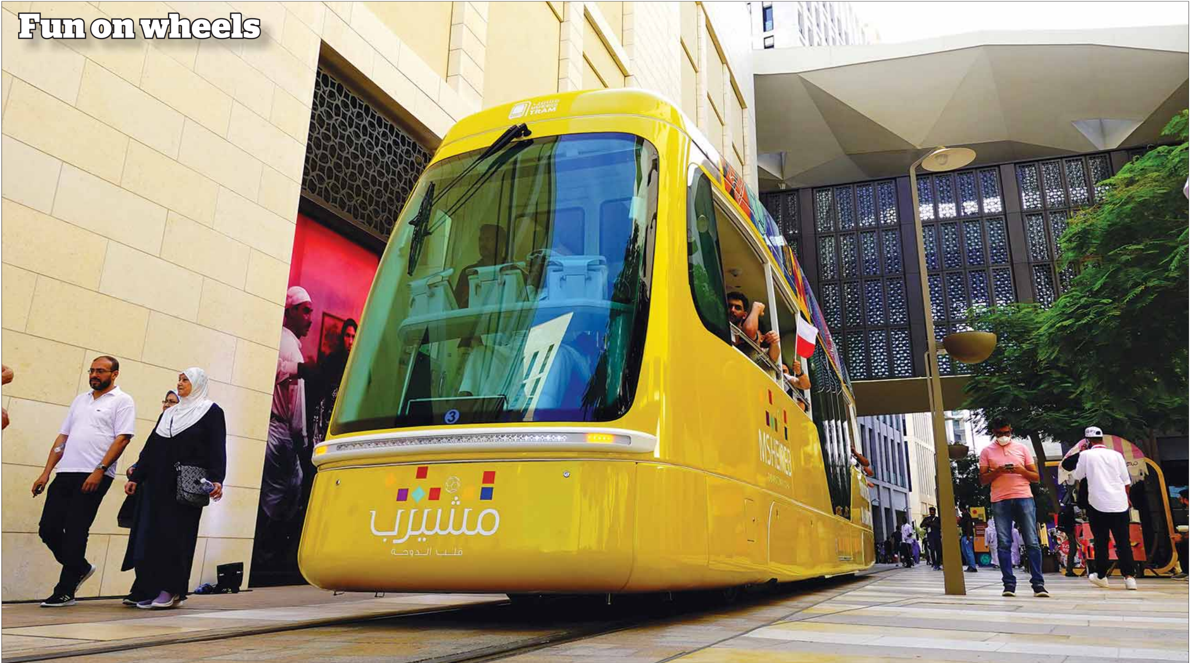
A tram tour of Msheireb Downtown Doha (MDD), which offers an immersive and comprehensive experience with FIFA World Cup Qatar 2022 activations, has become a big hit among the thousands of visitors. MDD has three zones for fans and media coming from all over the world to enjoy the games and celebrate together. The first is the Baraha Zone, the hub for watching the matches on a giant screen or in special pods which promote privacy while fostering social interaction. The second is the Heritage Zone where visitors can experience various activities and explore the essence of authentic Qatari heritage. The third is the Sikka Zone with selfie-worthy spots covering art exhibitions and cinematic works. It includes interactive zones where fans can play games and relax at cafes and restaurants. Broadcast and media facilities are also available for journalists and content creators. The activities and facilities in Zone 3 also include Connebol Tree of Dreams, Mawater Warehouse Exhibition, Intaj - Film, Television, and Theatre Exhibition and Quest Gaming District. PICTURE: Gulf Times news editor Bonnie James.