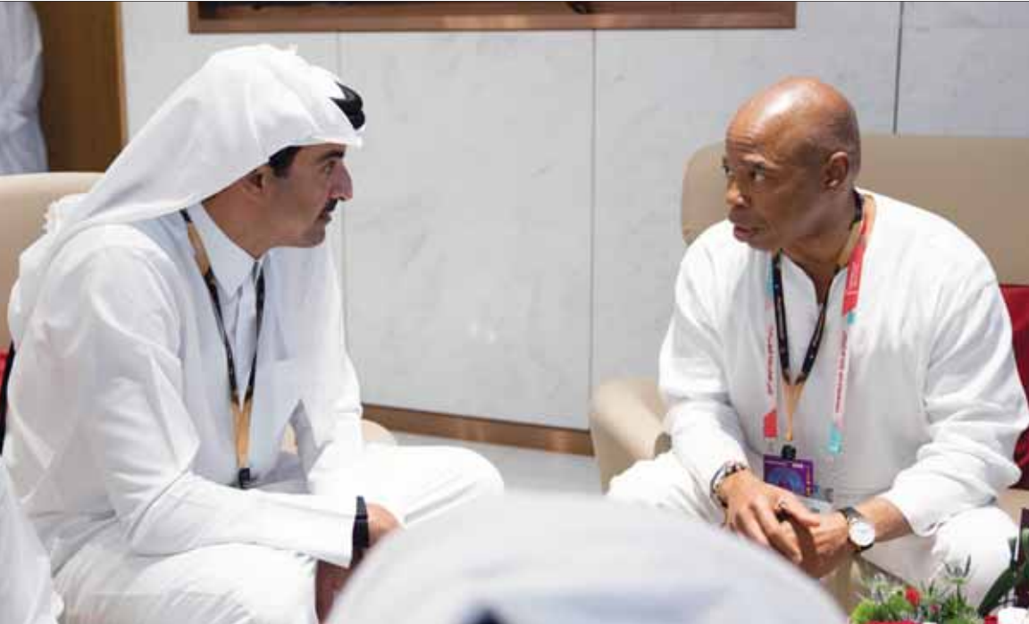
His Highness the Amir Sheikh Tamim bin Hamad al-Thani met yesterday evening at Al Janoub Stadium with Mayor of New York City Eric Adams, who is currently visiting the country to attend part of the FIFA World Cup Qatar 2022 matches. During the meeting, they discussed co-operation relations between Qatar and the United States, in addition to discussing several issues of mutual interest.