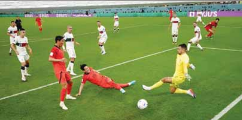
South Korea’s Kim Young-gwon scores their first goal against Portugal during the FIFA World Cup Qatar 2022 Group H match at Education City Stadium yesterday.

However, Suarez finished the match on the bench in tears as the news came in of South Korea’s last-gasp victory over Portugal, which meant the Asian side had moved above the Uruguayans into second place in Group H on goals scored. “We had several chances to score the third goal (which would have put Uruguay through),” said Uruguay coach Diego Alonso. “For 80 minutes we were qualified and we had lots of chances, but in the end it wasn’t possible.” Also yesterday, Switzerland booked