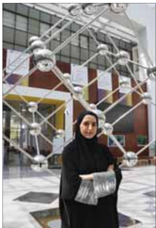
QU, within the graduate studies, diploma, master's or PhD programme.

The importance of the Graduate Studies Open Day is to provide all the necessary information and a detailed explanation for students who plan to complete their graduate studies and move forward in their scientific and practical career at