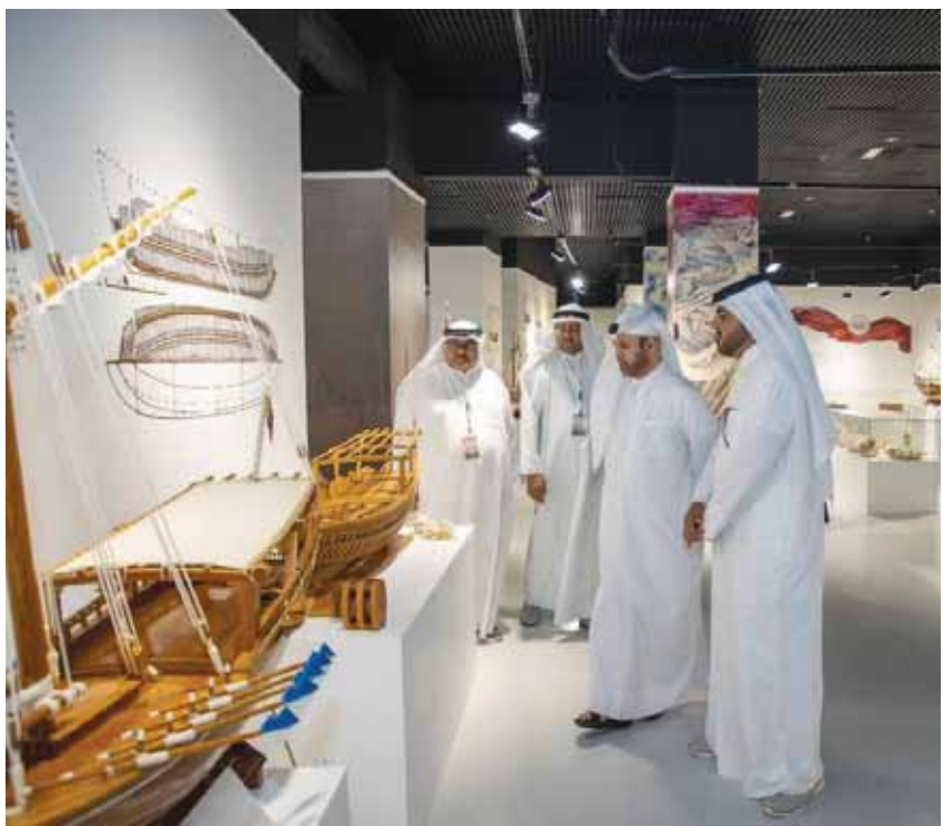
Snapshots from the exhibitions at Katara.