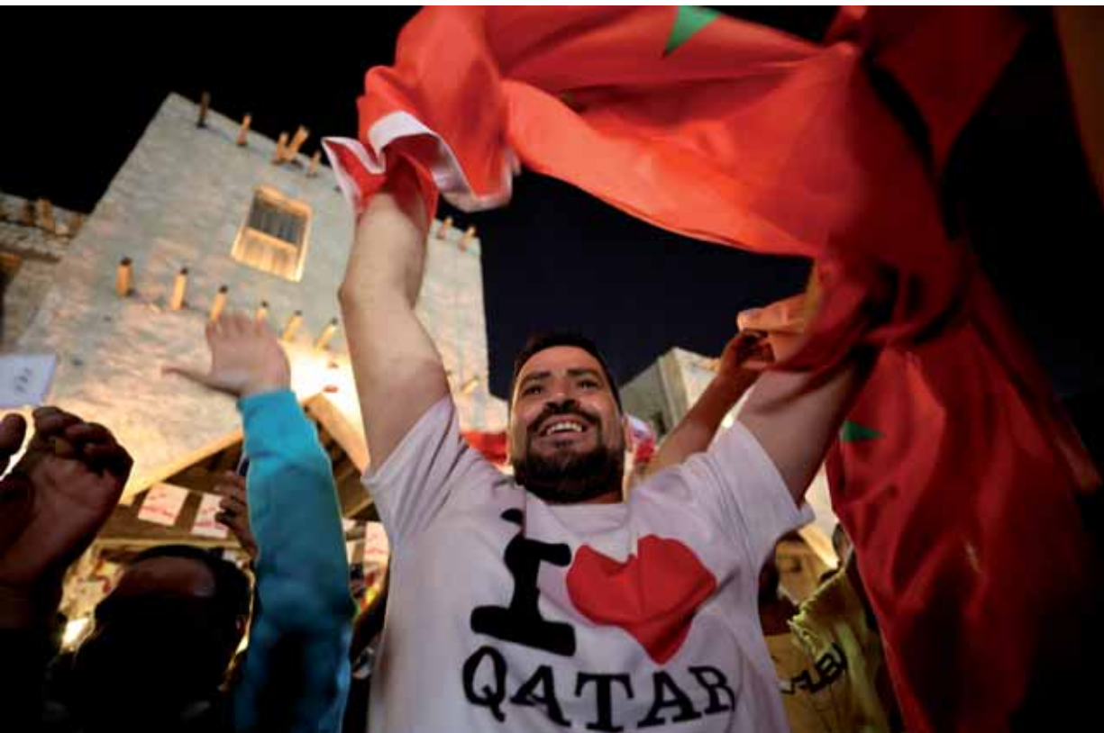
Moroccan fans celebrate in Souq Waqif after their team qualified for the knockout stages by beating Canada yesterday.

Morocco's red-clad army of fans added an extra decibel or two to the last bars of the national anthem before kick-off, sounding a deafening warning to Canada as they willed their team to victory in their Group F game yesterday and top spot in the standings. It was a spine-tingling start to yet another match where Moroccan supporters, many of whom live and work in Qatar, packed out the stadium and nearly raised the roof, handing their side a distinct advantage. An early goal added to the clamour as the North Africans quickly set about beating Canada and securing their place in the next round, finishing ahead of 2018 World Cup runners-up Croatia and eliminating the highly fancied Belgium who are second in the FIFA rankings. If ever there was a side at this World Cup with a veritable 12th man, it is the Moroccans whose level of play at the tournament has been raised a notch or two by the vociferous support. It carried them through a fatigue-filled second half against Canada at the Al Thumama Stadium and was certainly the decisive factor last Sunday when they beat Belgium to set up their unexpected progress to the last-16. With 20 minutes left against Belgium, and the score still 0-0, Morocco were visibly tiring, the ferocity of the tussle taking its toll on players who rarely play in matches of such intensity. The din of a concerned crowd transformed into a tumultuous racket when Abdelhamid Sabiri's free kick