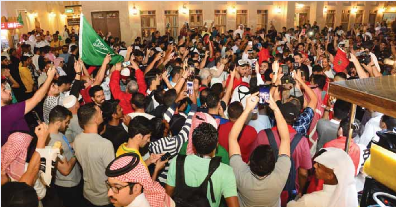
Moroccan fans celebrate their team's entry to the Round of 16 in the ongoing FIFA World Cup Qatar 2022 at Doha's Souq Waqif yesterday. Morocco beat Canada 2-1.