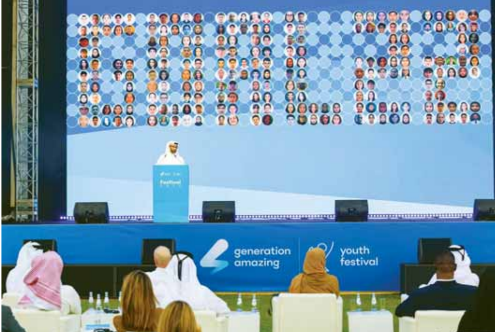
The youth involved represented each of the 32 competing nations at Qatar 2022.

Sponsors included Qatar Airways, Visit Qatar, the Qatar Fund for Development, Qetaifan Projects, QLM Insurance, SDIsports, and Hublot.