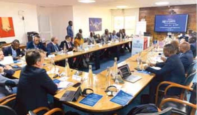
The first National Focal Points (NFPs) Regional Forum for Africa took place in Dakar.

The International Centre for Sport Security (ICSS) and its partners, the United Nations Office of Counter-Terrorism (UNOCT) and the United Nations Interregional Crime and Justice Research Institute (UNICRI), along with representatives of Senegal, joined forces to host the first National Focal Points (NFPs) Regional Forum for Africa. The event, which took place in Dakar on November 30 and December 1, was aimed at being a reference event in Africa to engage high-level policymakers, stakeholders and youth in terms of major sporting events (MSEs) and to build resilience to violent extremism. The forum was organised within the