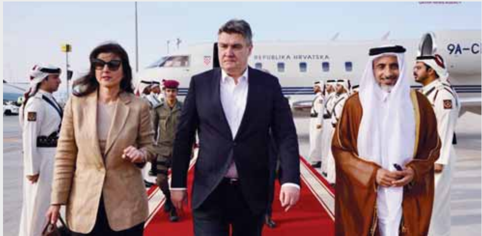
President of Croatia Zoran Milanovic arrived yesterday in Doha to attend part of the FIFA World Cup Qatar 2022 matches. The president and the accompanying delegation were received upon arrival at Hamad International Airport by HE the Minister of Sports and Youth Salah bin Ghanem bin Nasser al-Ali and ambassador of Croatia to Qatar Drago Lovric.