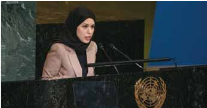
HE Sheikhha Alya Ahmed bin Saif al-Thani

HE Sheikhha Alya reiterated Qatar's strong condemnation of the repeated attacks on the Al-