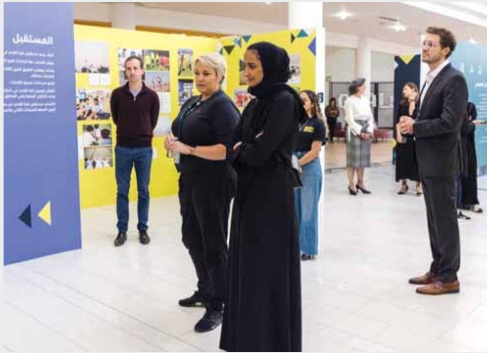
HE Sheikha Hind bint Hamad al-Thani, Vice-Chairperson and CEO of Qatar Foundation (QF), visited the GOALS exhibition at Education City as it continues to tell the story of the FIFA World Cup through the eyes and words of those who are experiencing it themselves. The exhibition is a collection of stories, images, and videos created by people living, working, and studying in Qatar, and is showcased at QF partner university Virginia Commonwealth University School of the Arts in Qatar. Following the exhibition visit, HE Sheikha Hind explored the Fan Experience activations on offer at Education City. The activations, which are held on Education City Stadium FIFA World Cup Qatar 2022 match days - three hours before and two hours after games - include a variety of multisensory experiences, educational activities, and cultural performances that showcase the heritage of Qatar and the wider region.