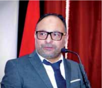
By Yasser M Dhouib

Football has been a unifying force across time and space, bringing together fans from all over the world to share a common love. It strengthens ties among nations and promotes co-operative growth on a global scale. Every four years, the FIFA World Cup has been instrumental in the development of infrastructure and the advancement of foreign policy goals for countries that have hosted it.