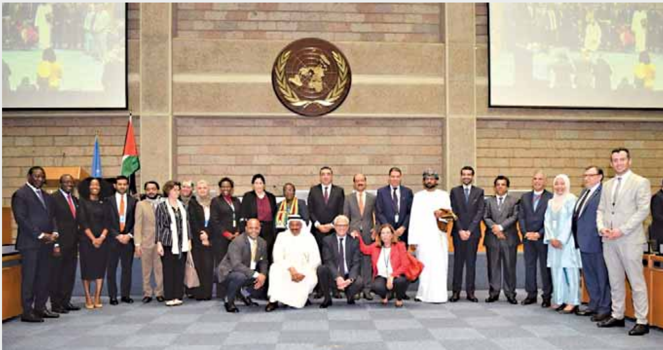
Qatar participated in the official ceremony of the International Day of Solidarity with the Palestinian People that was held in office of the United Nations in the Kenyan capital Nairobi. Ambassador of Qatar to Kenya Jabor bin Ali al-Dosari represented Qatar in the ceremony. (QNA)