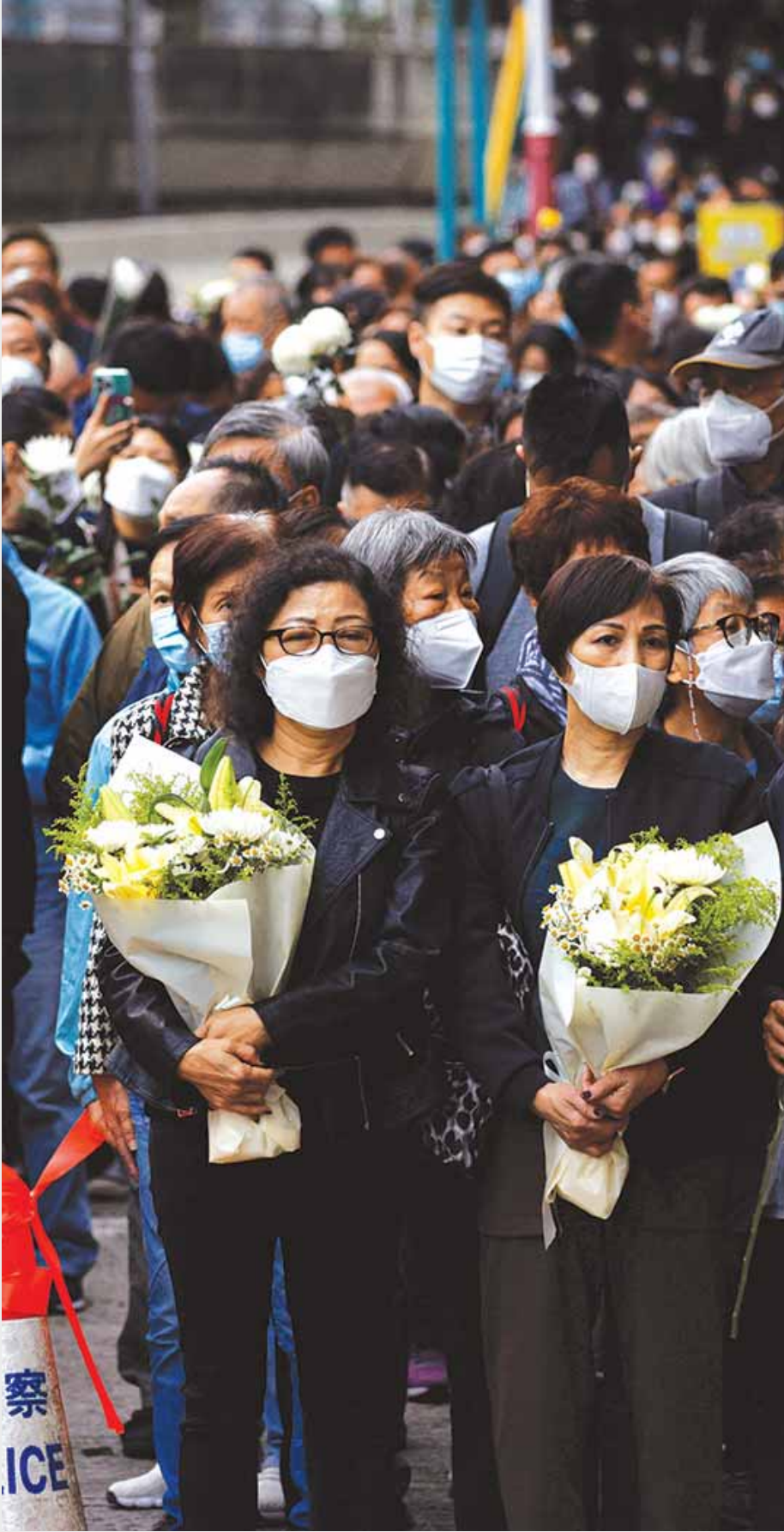
People queue up to pay tribute to former Chinese president Jiang Zemin, after he died aged 96, outside China’s Liaison Office, in Hong Kong, China, yesterday. Jiang died on Wednesday of leukaemia and multiple organ failure.