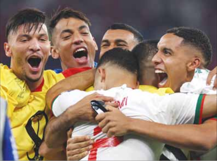
Morocco's players celebrate winning the Qatar 2022 World Cup Group F football match between Canada and Morocco at the Al Thumama Stadium in Doha yesterday.

second African team so far – to make it to the last 16. This is the first time Morocco have entered the knockout stages of the tournament since 1986, and their second till date. The stellar Moroccan show leads