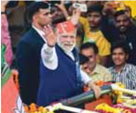
The BJP has not lost in the western industrial state since 1995 and Modi served as its chief minister for nearly 13 years

rat, the state’s second largest city and a diamond cutting and polishing hub, lined up to cast their ballot in the first of the two-phase election.