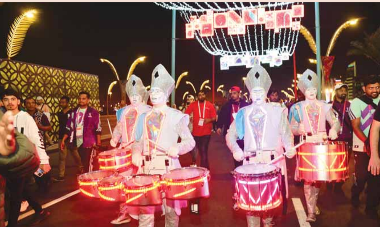
The Corniche street festival is among the various activations visitors can enjoy during the World Cup.