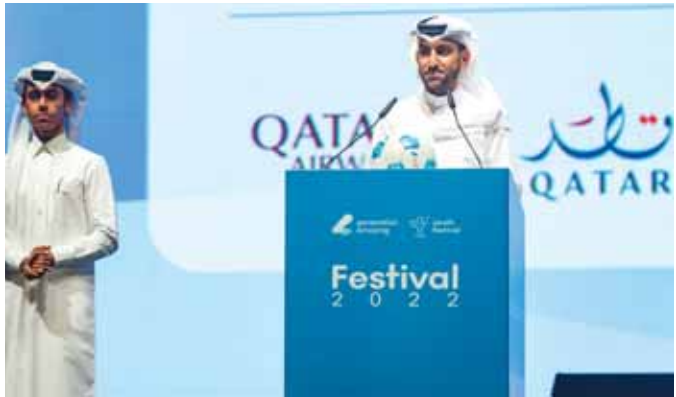
Special remarks were made to more than 600 guests during the event.

Since 2019, Generation Amazing has hosted its youth festival on the sidelines of major sporting events, such as the FIFA Club World Cup and FIFA Arab Cup.