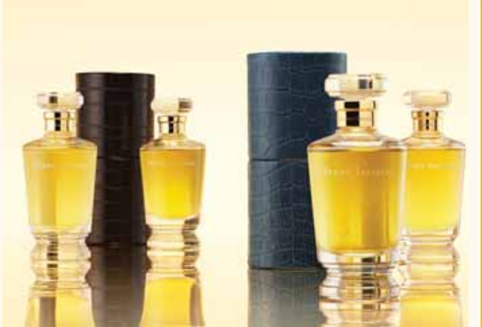
From the collection.

A playful entry into the world of Haute Parfumerie, Les Brumes are a perfect gift for the upcoming festive season, for those with a passion for fragrance and an appreciation for savoir-faire. Like the more traditional Essences, Les Brumes allow wearers to build their own perfume wardrobe, to compose their own signature, or imprint – in a more light-hearted way. Les Brumes offer a glimpse into the Henry Jacques’ Art-de-Vivre, a treasure trove of endless choices and a bountiful journey: the most precious and exclusive ingredients, rare and perfect – from the intricate Les Exceptions masterpieces, the innovative Clic-Clac solid perfumes, and the pinnacle of Haute Parfumerie, Les Sur-Mesures, or Bespoke. The 50 Les Brumes are now available at Henry Jacques boutiques in the Middle East: Galeries Lafayette Doha, the Dubai Mall Fashion Avenue extension, and the Galleria Mall – Abu Dhabi.