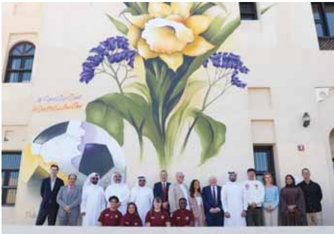
Snapshots from the UK Festival.

"It is a real pleasure to be here in Qatar and see the activities