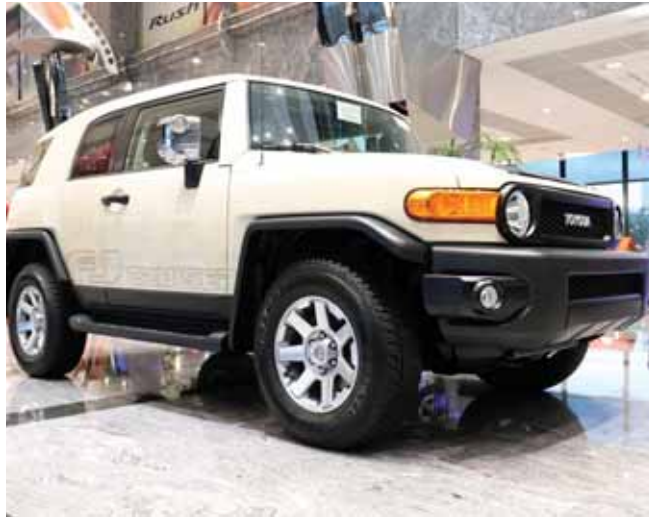
The 2023 FJ Cruiser 'Final Edition'.

"The FJ Cruiser's legendary status as one of the most unique Toyota SUVs and proven durability throughout the years will live on in the hearts of its owners and the Toyota family," the statement added.