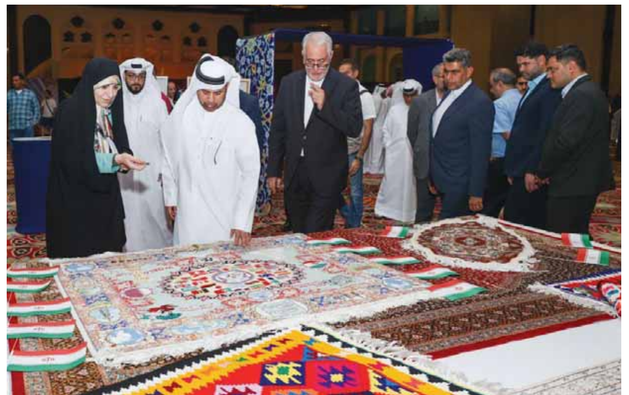
Snapshots from the event yesterday.

The Katara Oud Centre organises courses on playing the oud, and these