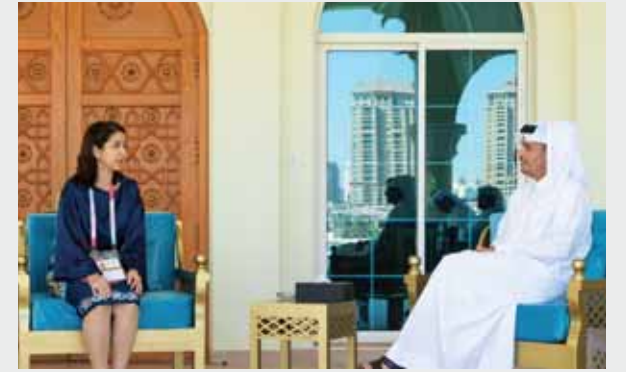
HE the Deputy Prime Minister and Minister of Foreign Affairs Sheikh Mohamed bin Abdulrahman al-Thani met yesterday with Costa Rica's Second Vice-President and Minister of Sports, Mary Munive Angermuller, who is visiting the country to attend the FIFA World Cup Qatar 2022. During the meeting, they discussed bilateral relations, especially in the cultural field, and Qatar's distinguished hosting of the World Cup.