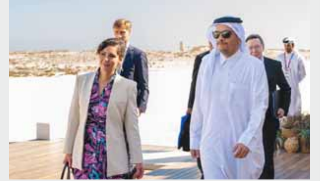
HE the Deputy Prime Minister and Minister of Foreign Affairs Sheikh Mohamed bin Abdulrahman al-Thani met yesterday with Belgian Minister of Foreign Affairs, European Affairs and Foreign Trade and the Federal Cultural Institutions Hadja Lahbib, who is visiting the country to attend the FIFA World Cup Qatar 2022. The meeting dealt with reviewing bilateral co-operation, particularly in energy, and Qatar's efforts in the field of human rights, in addition to developments in the Middle East and Afghanistan, and the latest of the nuclear talks. (QNA)