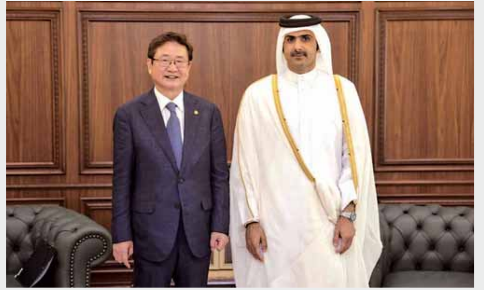
HE the Minister of Culture Sheikh Abdulrahman bin Hamad al-Thani met yesterday with the visiting South Korean Minister of Culture, Sports and Tourism Park Bo-gyoon and his accompanying delegation. The meeting discussed aspects of cultural co-operation between the two countries. (QNA)