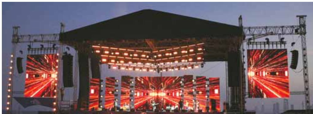
A view of the venue.

Visitors and fans can take part in various activities to celebrate special moments.