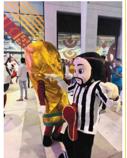
Roving parades at Msheireb Downtown Doha.