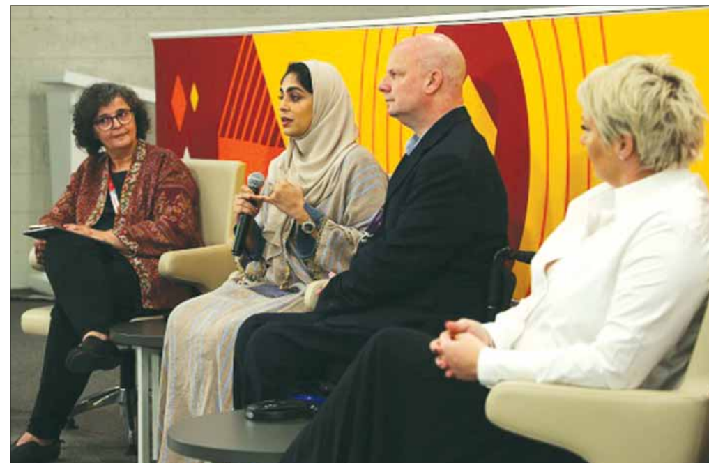
Experts at the panel discussion.

With QF supporting the delivery of a truly accessible tournament, experts from the organisation reflected on the accessibility efforts and initiatives that QF has established - from its specialised schools such as Renad Academy and Awsaj Academy, to its Ability Friendly Programme, sensory rooms, audio-descriptive commentary of matches, the Accessibility