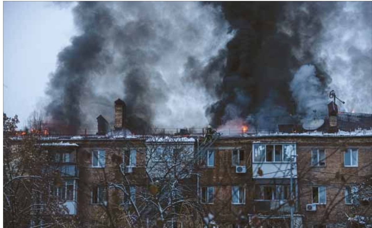
A residential building destroyed by a Russian missile attack in the town of Vyshhorod near Kyiv yesterday.

Since October, Russia has openly acknowledged targeting Ukraine's civil power and heating systems with long-range missiles and drones. Moscow says the objective is to weaken Kyiv's ability to fight and push it to negotiate; Ukraine says the