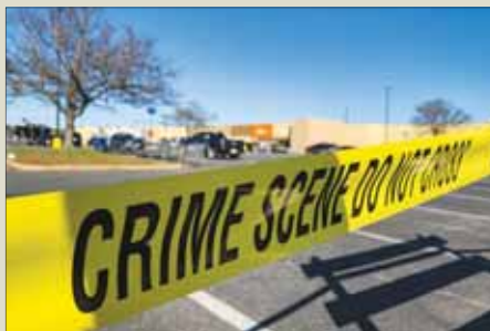
Crime scene tape blocks the parking lot of a Walmart following the shooting.

"It didn't even look real until you could feel