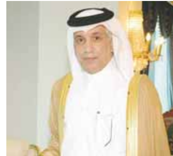
HE the Minister of State for Foreign Affairs Sultan bin Saad al-Muraikhi

He also thanked High Representative for the UNAOC Miguel Angel Moratinos and his work team for organising the forum that comes at the appropriate time and requires intensifying the efforts in pursuit of bringing the peoples, civilisations and religions together in the midst of divisions under the echo of hate speech and racism which are unfortunately rampant in the world today.