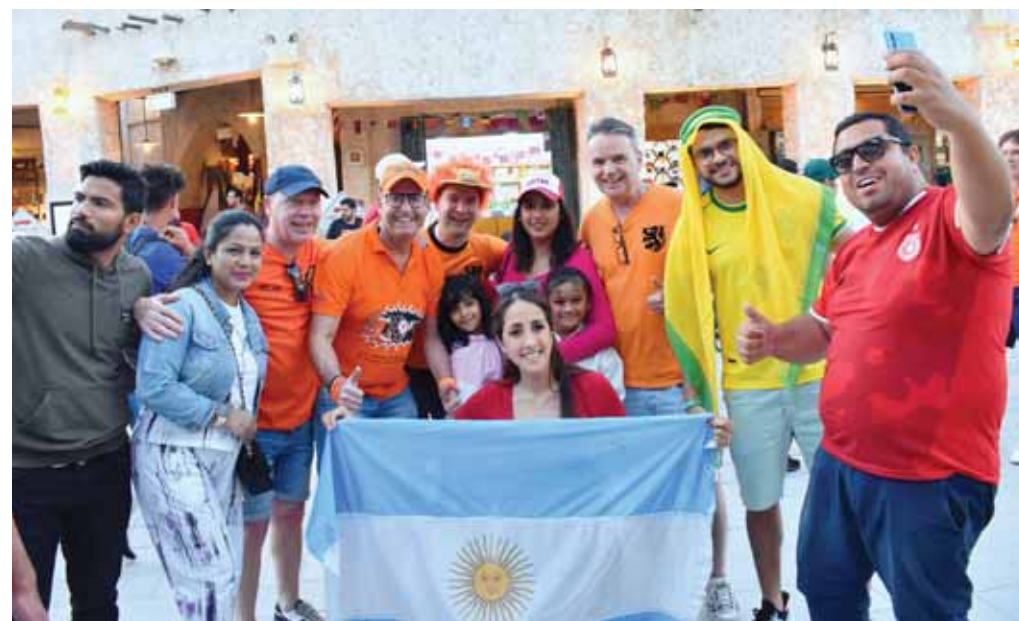
Football fans from across the world and Qatar residents throng Souq Waqif round-the-clock.