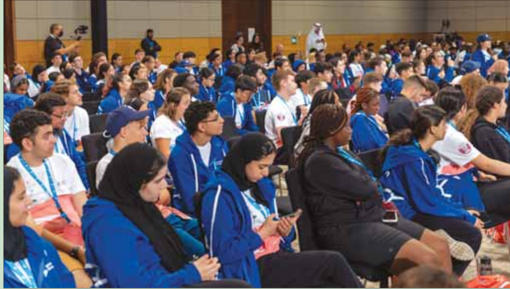
Participants at the event.

Nascimento-DeLuca highlighted that in today's day and age, with the spread of social media, it is amazing to see how sports can change the way people feel about an entire culture. During her talk, Nascimento-DeLuca also touched upon the issues of gender gap, and how closing it can help in building better societies. According to her, there is a link between sustainable development and