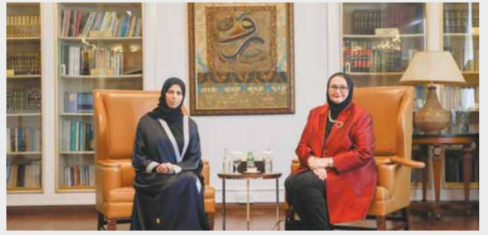
HE the Assistant Foreign Minister Lolwah bint Rashid AlKhater met with Deputy Prime Minister and Minister of Foreign Affairs of Bosnia and Herzegovina Dr Biser Turkovic, who is currently visiting the country. During the meeting, they discussed the relations of bilateral co-operation and several topics of common interest. (QNA)