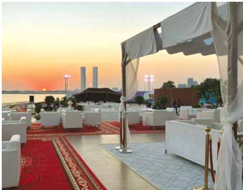
The VIP lounge.