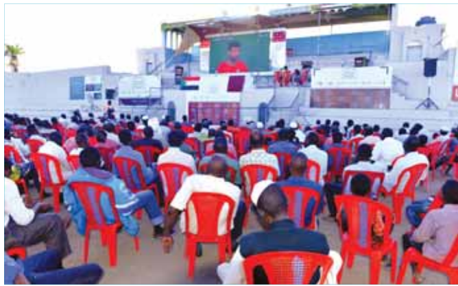
Fan zones at different places.