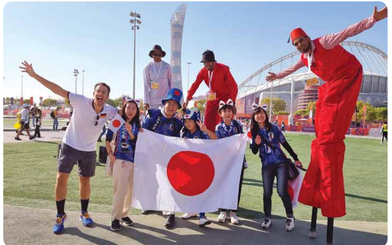
Both Japanese and German football fans spend time taking videos and pictures.