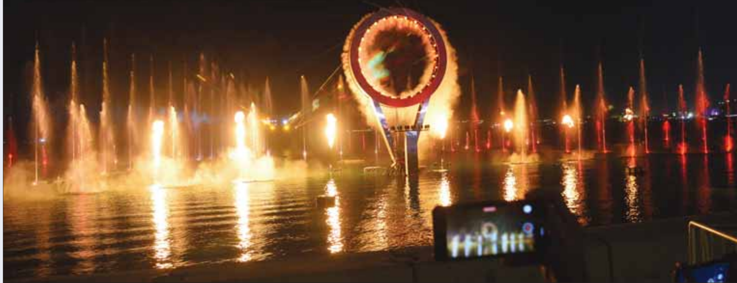
Glimpses from the FIFA Fan Festival and the Doha Corniche World Cup celebrations yesterday.