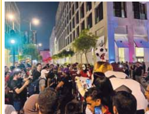
Fans throng Msheireb Downtown Doha to celebrate football.