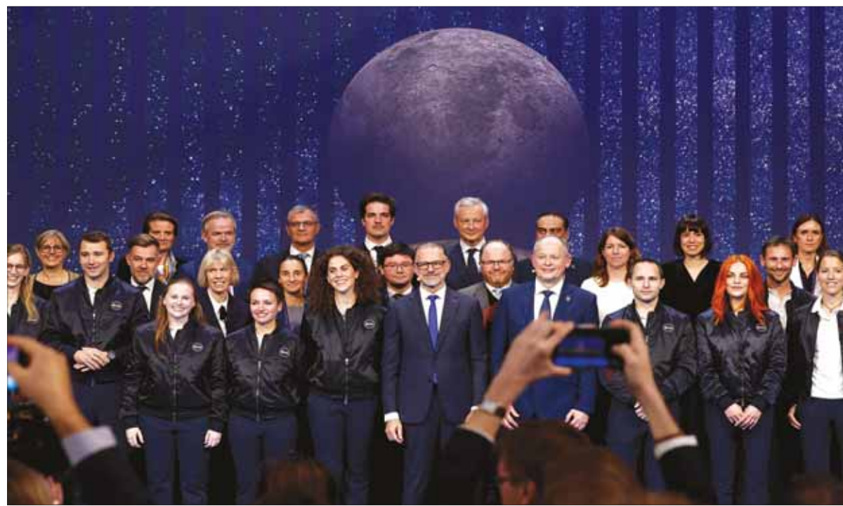
European Space Agency General Director Josef Aschbacher poses with members of its new class of astronauts during the European Space Agency Council at Ministerial level (CM22) at the Grand Palais Ephemere in Paris yesterday.