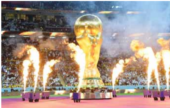
The opening ceremony of the FIFA World Cup Qatar 2022 on Sunday.

The Cabinet highlighted the important contents of the Amir's speech when opening the tournament, and the dazzling preparation, organisation and directing of the historic opening ceremony; hailing the ceremony's performances which carried messages of deep meanings, reflected the bright images of the civilisational and cultural heritage of Qatar and the Arab world, and emphasised the human dimension of sport