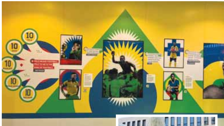
Snapshots of the exhibition.

largest LNG (liquefied natural gas)-powered ship – with up to 25% less carbon emissions and significantly reduced local pollutants compared to standard marine fuels. "The Future of Cruising is our new class of trailblazing ships that set new standards of luxury, innovation and sustainability," he said. "The MSC World Europa is the first in her class, and has already broken capacity and size records, setting new standards of what luxurious cruising means, and is our most sustainable and futuristic cruise ship to date," Onorato added. This state-of-the-art vessel, he said, is powered by cleaner fuel, and with green technology integrated throughout the ship – "a statement of our commitment to protecting the sea and our planet as a whole". "We have clear goals that we are working towards – our aim is to achieve a 40% reduction in carbon emissions intensity by 2030 against 2008 baseline, and net-zero emissions by 2050," he added. "These will be achieved by our ongoing research and investment in eco-friendly fuel, waste management and decarbonisation technologies," Onorato said. The MSC Cruises chief lauded and congratulated Qatar and its people for taking on the challenge to host one of the World's biggest events – the FIFA World Cup 2022. "It is no easy feat, and we have no doubt in our mind that they will put on a great show," Onorato said. "To the people making their way to Qatar, be prepared to be welcomed with open arms and unforgettable experiences."