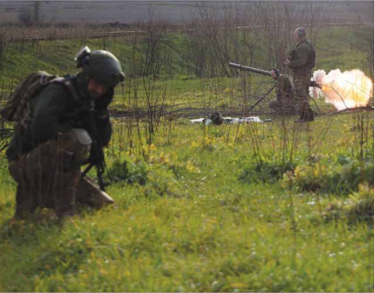
Ukrainian servicemen fire towards Russian positions on the frontline of the Donetsk region on Monday amid the Russian invasion of Ukraine.