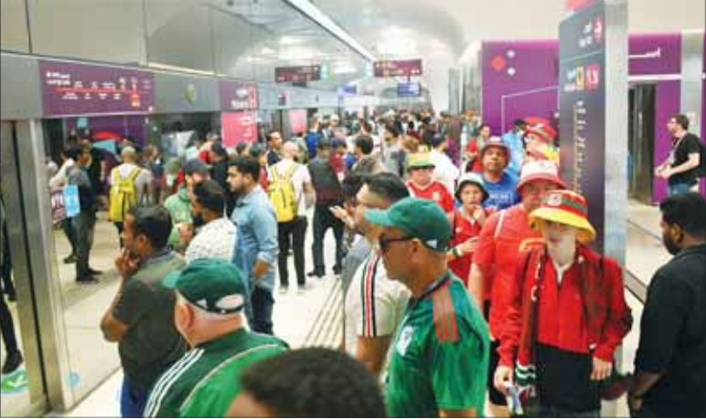
Football fans from various countries at a Doha Metro station.

The world has descended on Doha, as thousands of fans reach the country everyday bringing along various cultures and languages and the Doha Metro has taken the central stage of cultural exchange. With the Doha Metro being the major transportation option for the football fans and visitors to reach the stadiums as well as other major locations in the country, it has turned out to be a melting pot of cultures. At every Metro station, thousands of fans from various countries can be seen moving around, mingling together and going to various places as they start their daily routine from morning. Many of them come in groups and move along while many others could be singles or couples. Several of them exchange their phone numbers and make sure to meet every day at a given time and the metro stations are the main rendezvous point for them.