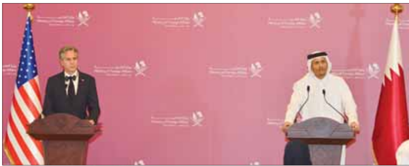
HE Sheikh Mohamed bin Abdulrahman al-Thani and Antony Blinken holding a joint press conference in Doha yesterday.

He added that Qatar always looks forward to strengthening its co-operation with the US, and always having an open dialogue and a relationship based on transparency and mutual trust between the two countries.