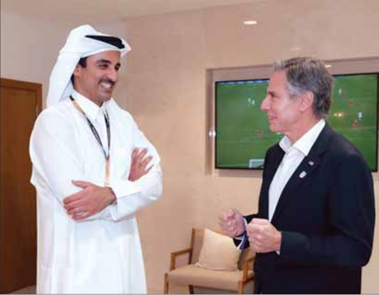
His Highness the Amir Sheikh Tamim bin Hamad al-Thani has met with Secretary of State of the friendly United States of America Antony Blinken, at Ahmad Bin Ali Stadium. The meeting discussed the strategic relations between the two countries and aspects of promoting them in various fields.