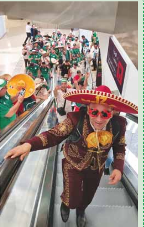
Doha Metro stations witnessed Mexicans singing and dancing while disembarking.

a Middle Eastern country in history, it is learnt.