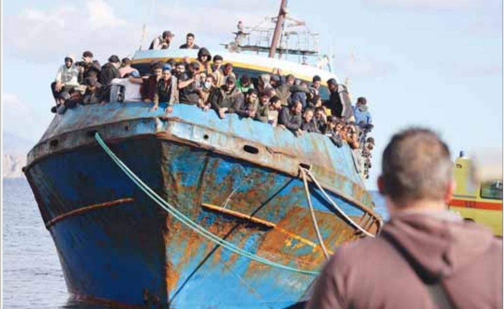
Migrants stand onboard a fishing boat at the port of Paleochora, following a rescue operation off the island of Crete, Greece yesterday.

ese peninsula. The boat went down beneath a huge vertical cliff. At least eight people died and survivors – mainly from Iraq, Iran and Afghanistan – were hauled to safety with ropes and a construction crane in a frantic pre-dawn operation. Greece, Italy and Spain are among the countries used by people fleeing Africa and the Middle East in search of safety and better lives in the European Union. The Greek coastguard has said it has rescued about 1,500 people in the first eight months of the year, compared with less than 600 last year. Dozens more have perished in sinkings over the last month. The International Organisation for Migration has recorded nearly 2,000 migrants killed and missing in the Mediterranean Sea this year.