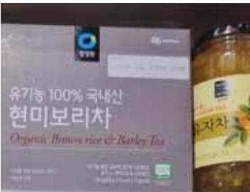
Supermarkets see high demand for Korean products in Qatar.