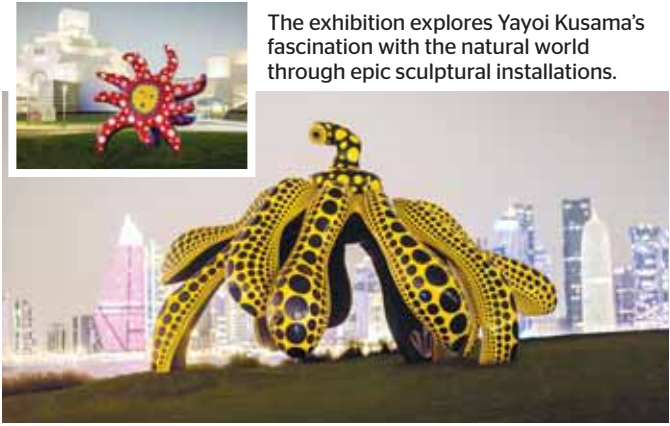
The exhibition explores Yayoi Kusama's fascination with the natural world through epic sculptural installations.