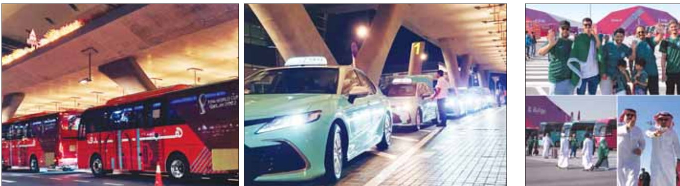
For more details contact 44426038