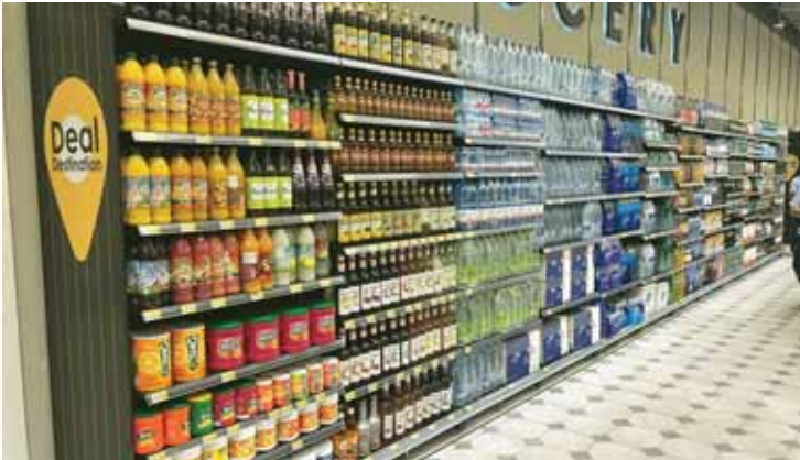
LuLu stores have enough stock of food and beverage items catering to the needs of football fans.

He disclosed that Safari is also offering ready-to-eat 'easy meals' for customers, including for ve-