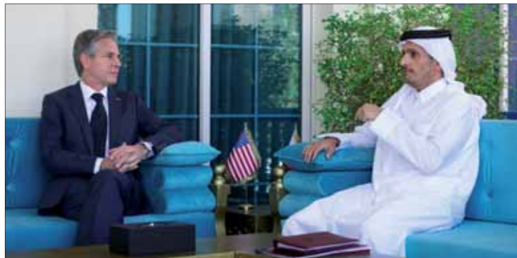
HE the Deputy Prime Minister and Minister of Foreign Affairs Sheikh Mohamed bin Abdulrahman al-Thani met yesterday with US Secretary of State Antony Blinken on the sidelines of the Fifth Qatar-US Strategic Dialogue currently taking place in Doha. During the meeting, they discussed the close relations between the two countries in all fields, international issues of common concern, especially the developments of the negotiations to return to the Joint Comprehensive Plan of Action (JCPOA) with the US, the situation in the Palestinian territories, Iraq and Lebanon, and the repercussions of the crisis between Russia and Ukraine and ways to resolve it peacefully, in addition to several issues of common interest. Blinken praised the distinguished organisation of the FIFA World Cup Qatar 2022.

Blinken affirmed that the US and Qatar are engaging in the region and outside the region to bolster stability, defuse tensions and end the conflicts, noting that Qatar had provided vital economic aid to the Palestinian people, helped pay the salaries of the security forces in Lebanon and has been a mediator in the peace agreement between the Chadian transitional government and the opposition groups, adding that Qatar is constantly working to heal the regional rifts which is essential in addressing the common challenges facing the US and its partners.