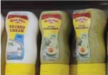
Mexican food products on display at a supermarket in Doha.