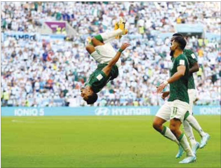
Saudi Arabia's midfielder Salem al-Dawsari celebrates scoring his team's second goal during the Qatar 2022 World Cup Group C match against Argentina at the Lusail Stadium yesterday.

Saudi Arabia sent the Arab world into a frenzy with a stunning comeback victory over tournament contenders Argentina at the FIFA World Cup Qatar at the imposing Lusail Stadium yesterday. Superstar Lionel Messi and the thousands of Argentina fans were left shell-shocked as second-half goals from Saleh al-Shehri and Salem al-Dawsari helped Saudi to a 2-1 win in their Group C match in front of a record 88,012 audience. It was a brave and brilliant performance from Saudi – ranked 51 in the world to Argentina’s third – as they silenced critics who have questioned the football culture in the Middle East. The Green Falcons’ victory yesterday will rank as one of the biggest upsets in World Cup history along with England’s loss to the United States in 1950 and West Germany losing to Algeria in 1982. According to an analysis by Nielsen Gracenate, Saudi stood just 8.7% of registering a victory against two-time champions Argentina. But yesterday, they ripped the predictions to pieces with a heroic second-half show that kept their chance of reaching the last 16 for the first time since 1994 World Cup. King Salman bin Abdulaziz declared a public holiday in Saudi Arabia today to mark the achievement, a feather in