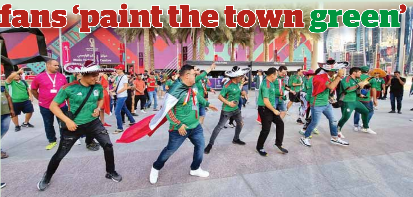
Mexican supporters entertain the crowd outside the DECC yesterday.