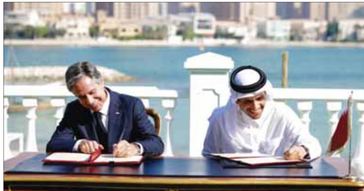
HE Sheikh Mohamed bin Abdulrahman al-Thani and Anthony Blinken signing a letter of intent between the governments of Qatar and the US on the World Cup Legacy.