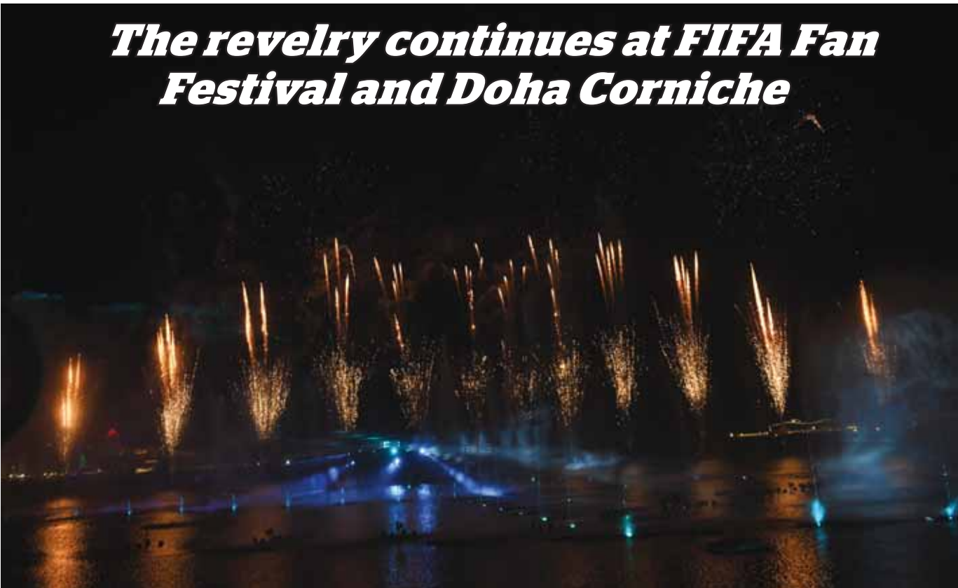
Football fans from across the world are having a great time at the FIFA Fan Festival at Al Bidda Park and Doha Corniche, enjoying entertainment and cultural events organised as part of the FIFA World Cup Qatar 2022.