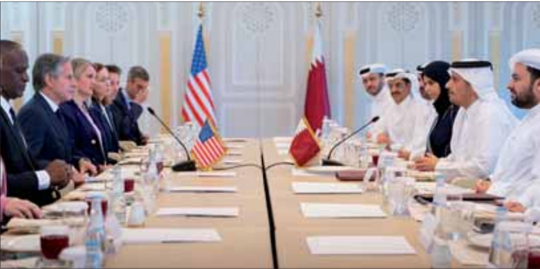
A session of the Fifth Qatar-US Strategic Dialogue in Doha.

● Qatar, US sign letter of intent on World Cup legacy