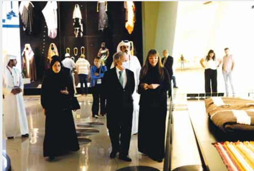
Ahead of the official opening of the FIFA World Cup Qatar 2022 on Sunday, UN Secretary-General Antonio Guterres visited the National Museum of Qatar (NMoQ). He was given a guided tour of the NMoQ's galleries.