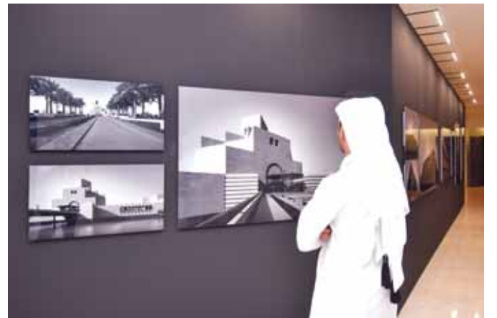
The Age of Modern Architecture

This pop-up exhibition showcases several crafts, such as the