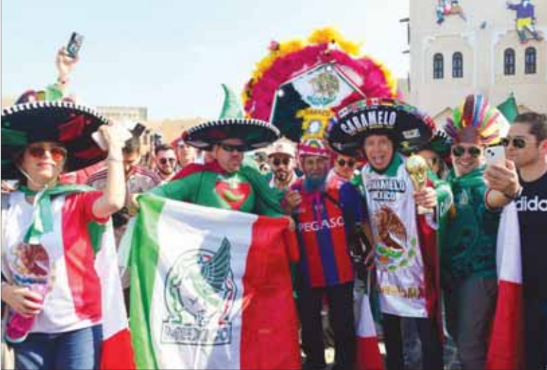
Fans celebrate at a Doha venue.

continued as fans in groups moving around and shouting support for their teams. Doha Metro is another favourite hangout for the fans as they move together from one place to another. As they get into the metro, they start singing in support of their teams in their own language, delighting everyone else in the cabin. The whole atmosphere is thrilling and cheerful and the merry-making continues all through the day and beyond.