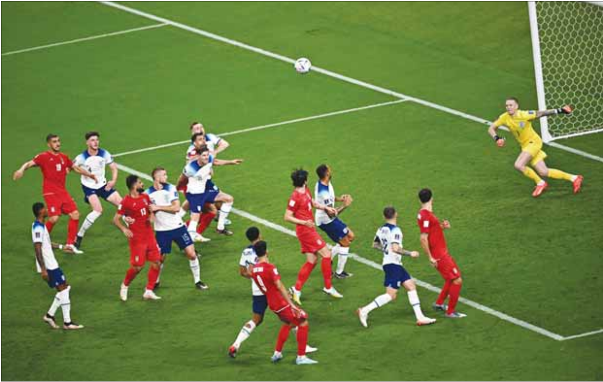
England's goalkeeper Jordan Pickford runs for the ball during the Qatar 2022 World Cup Group B football match between England and Iran at the Khalifa International Stadium in Doha yesterday.

Today, football icon Lionel Messi will lead Argentina against regional giants Saudi Arabia at Lusail Stadium. Messi has already confirmed this will be the final World Cup of his illustri-