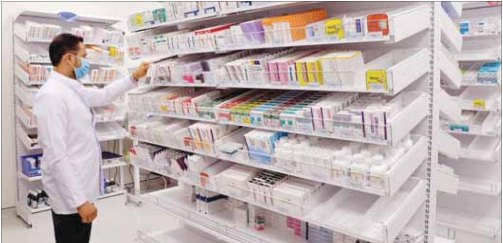
The campaign covers precautions to be taken in dealing with antibiotics.