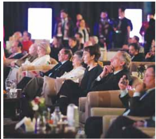
The Qatar embassy in Turkiye also held a party on the occasion.