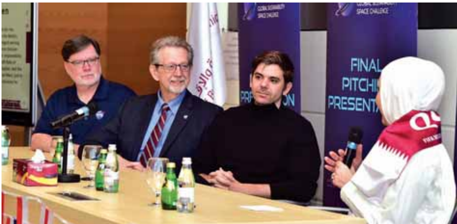
Snapshots from the event at Qatar University.