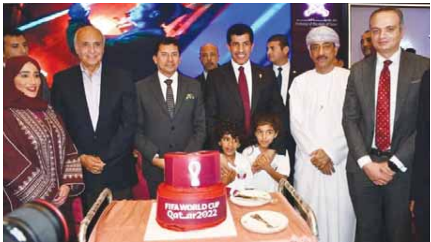
Qatar's embassy in Cairo set up a special area for fans of the FIFA World Cup Qatar 2022.