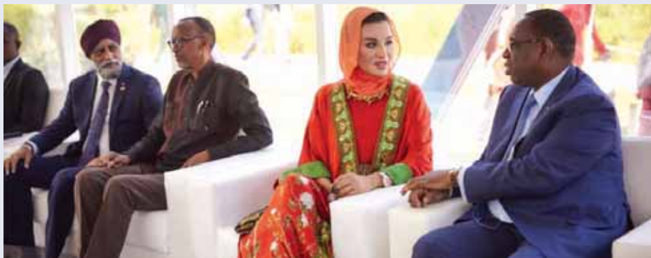
Her Highness Sheikha Moza with Presidents Sall ( right) and Kagame, and Canada's Minister Sajjan.