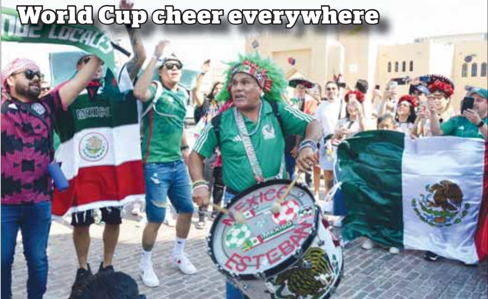
Fans from Mexico, in the town for the FIFA World Cup Qatar 2022, celebrate in Katara - the Cultural Village yesterday at the unveiling of sculptures gifted to Qatar. PICTURE: Shaji Kayamkulam Page 12

today, defending champions France will face Australia at Al Janoub Stadium. Sport Pages 1-8