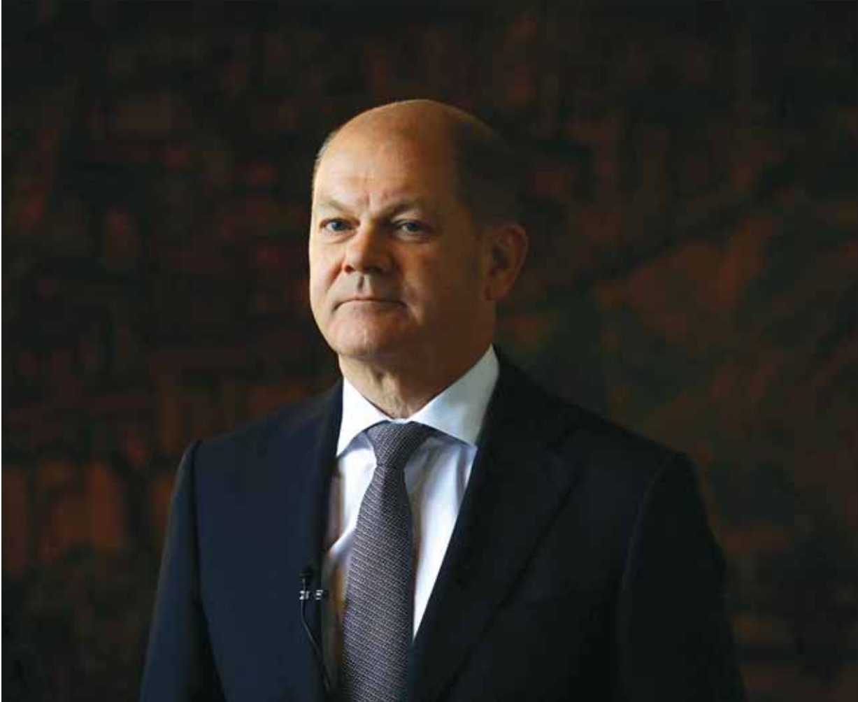
FRAGILITY: Germany has a complex, fragile coalition government under Chancellor Olaf Scholz that is often working at cross purposes, having been forged under the fairer-weather conditions of late 2021.