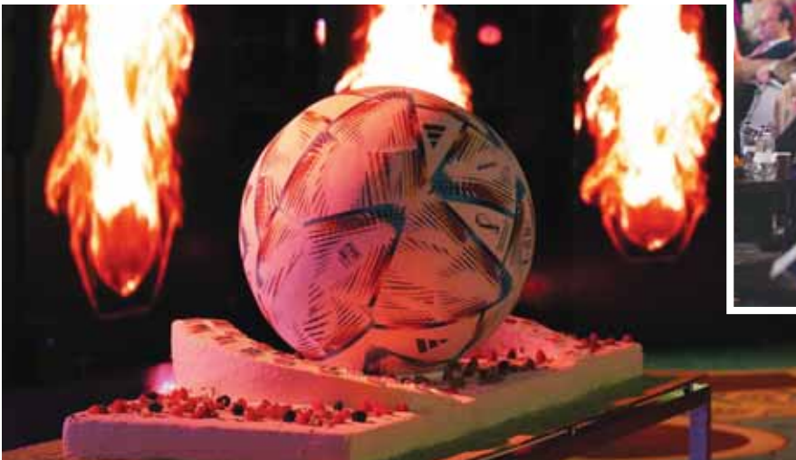
tournament opening ceremony.

Traditional Qatari dishes were served in a tent erected for the event.