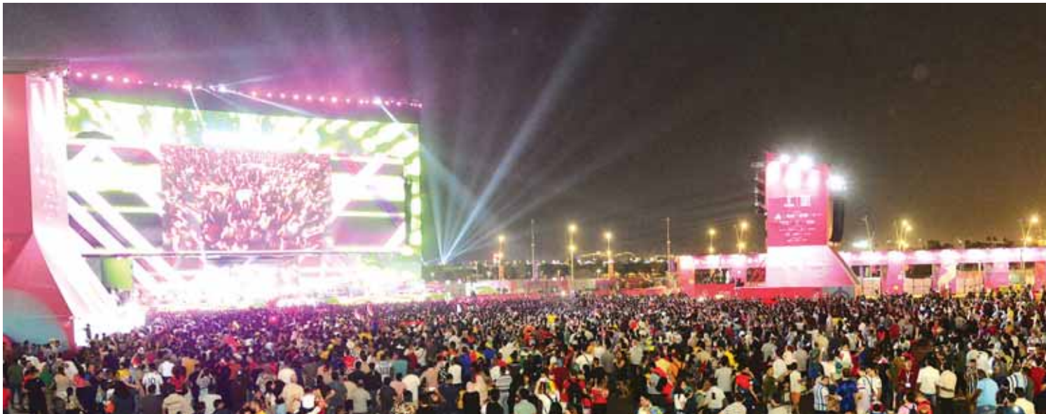
A big crowd watching the big screen at the FIFA Fan Festival, Al Bidda.