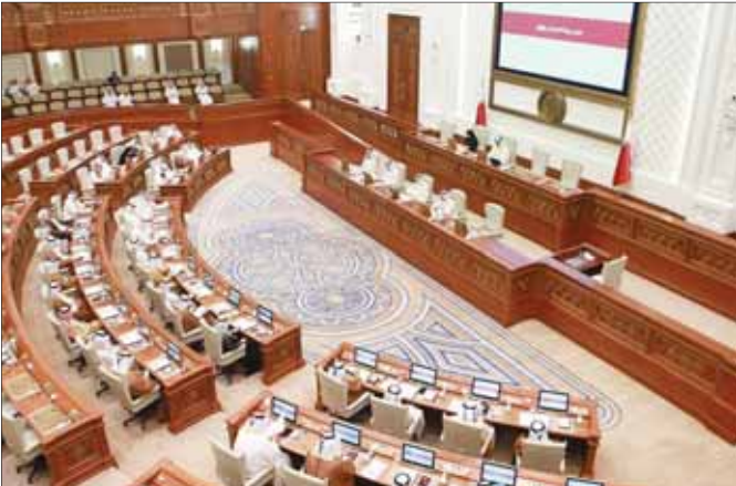
The Shura Council in session.

as the excellence and brilliancy that were seen in organising the tournament – which will continue until December 18 – enhances the prestigious position that Qatar has reached in the field of sports, at the regional and international levels. The council also expressed its highest appreciation for the efforts that have been extorted by the Supreme Committee for Delivery & Legacy (SC) and various sectors in the country over the past 12 years; pointing out that the co-operation between them resulted in the implementation of major projects that strengthened the infrastructure of the State in several areas, created a bright reality for the country, and will leave a sustainable legacy for successive generations. The Shura Council also extended thanks to leaders of friendly countries who attended the World Cup opening ceremony alongside His Highness the Amir yesterday; welcoming the visitors of the country and wishing them a pleasant stay in Doha. The Shura Council looked forward