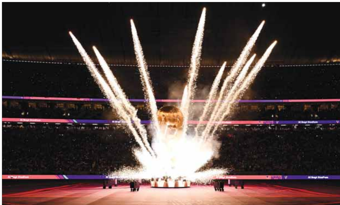
Fireworks surround a large replica of the World Cup trophy during the opening ceremony of the FIFA World Cup Qatar 2022 on Sunday.

In 2011, Qatar Airways announced its partnership with FIFA as the Official Airline. The alliance has gone on to connect and unite fans globally, with “The World’s Best Airline” also sponsoring numerous football tournaments such as the FIFA Confederations Cup 2017, the 2018 FIFA World Cup Russia, the FIFA Club World Cup, and the FIFA Women’s World Cup.