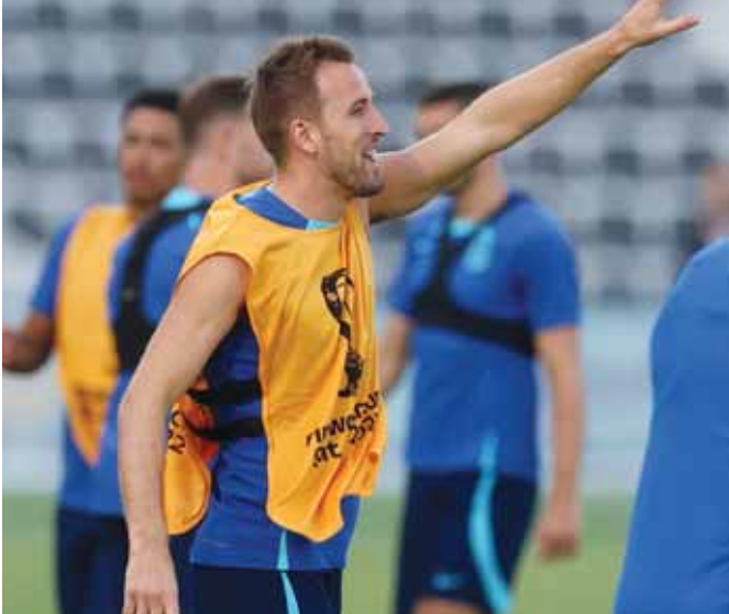
England's forward Harry Kane takes part in a training session at the Al Wakrah Stadium on the eve of the Qatar 2022 World Cup Group B match against Iran.

perienced Portuguese Carlos Queiroz and are 20th in FIFA’s rankings, will certainly be no walkovers. And Southgate is well aware of it.