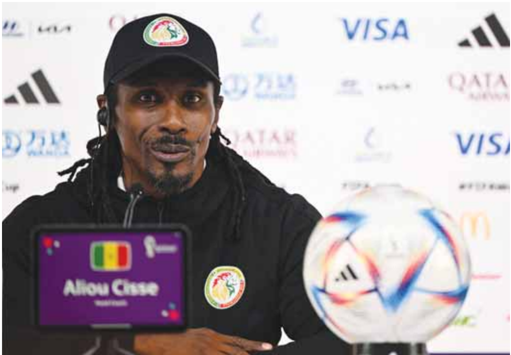
Senegal's coach Aliou Cisse attends a press conference at the Qatar National Convention Center in Doha yesterday.

around their best player. That’s what we have done too. I hope he recovers soon. The Dutch are a good side but we need to be true to ourselves. We don’t have to copy other people’s style of play. We are