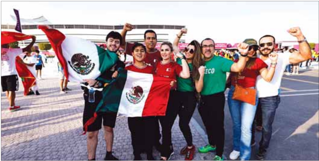
Mexico fans pose outside the Al Bayt Stadium in Al Khor yesterday.

Mexico and Poland kick-start their World Cup campaign tomorrow knowing the outcome of the clash could decide who survives beyond the group stage of the 2022 tournament. Group favourites Argentina take on unlikely contenders Saudi Arabia in the earlier duel, and barring a major upset in that match the second spot in the final group rankings is likely to go to either Mexico or Poland. Mexico's strong record of being unbeaten in their World Cup openers is a statistic any team could fear. They won five and drew one in the most recent six tournaments, always making it to the knockout stage. The last time Mexico failed to find their way past the group stage was back in 1978 — when they earned zero points in the