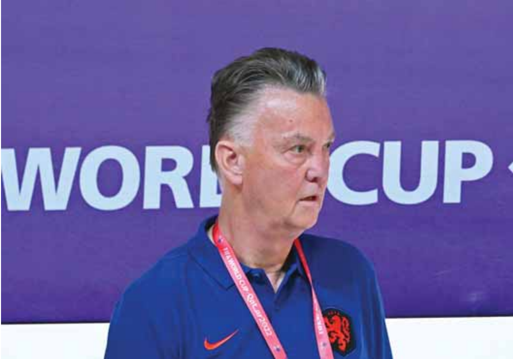
Netherlands' coach Louis Van Gaal addresses a press conference at the Qatar National Convention Centre in Doha yesterday.

“I am excited. The last past few days have passed slowly. We can’t