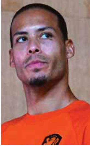
Netherlands' defender Virgil van Dijk attends a press conference in Doha.

“It is an important match, there’s no doubt. We want a good result. We want to start the World Cup on a good note,” he said. “Obviously it’s a great shame for Mane and for the team that he is not here. We have to think about the player safety. All coaches build their team