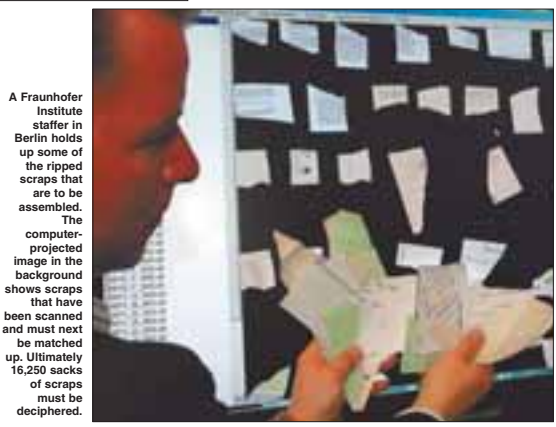
A Fraunhofer Institute staffer in Berlin holds up some of the ripped scraps that are to be assembled. The computer-projected image in the background shows scraps that have been scanned and must next be matched up. Ultimately 16,250 sacks of scraps must be deciphered.

holder, pen holder or paper tray," write the doctors in the British Journal of Sports Medicine . The desk is designed to slide over a standard treadmill, so the user can either walk and work, or, if the treadmill is replaced with a high chair, sit and work. Prof Levine and colleagues from the endocrine research unit of the clinic say for an obese worker, walking up an extra flight of stairs doesn't take long enough. In their experiment the doctors found the 15 volunteers – all but one of whom were women – expended considerably more energy when they worked and walked at a speed equivalent to one mile an hour compared to when they sat and worked. "Were the vertical workstation to be used by an obese office worker to replace two-three hours of sitting, and if other components of energy balance were constant, a weight loss of over 20kg a year could occur," they write. – Guardian News & Media