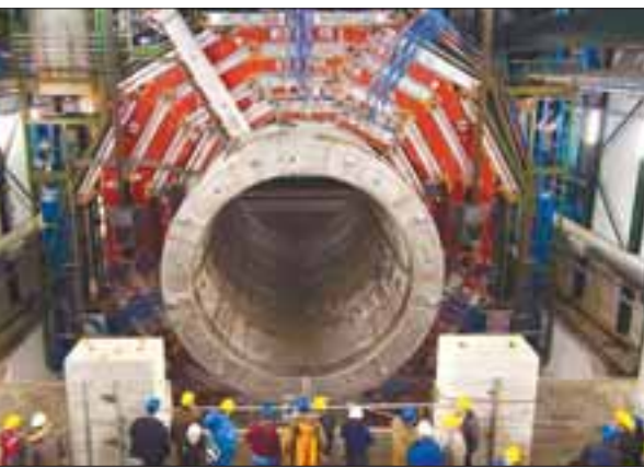
A 13,000-ton particle detector being installed in the Large Hadron Collider, the world's largest atom-smasher, in Geneva, Switzerland (above) and visitors to the CERN (Centre Européen de Recherche Nucléaire) listen to a guide at the 'Atlas' experimental area and assembly hall for the biggest superconducting magnets ever built, during an open day, in this October 2004 file photo (right).

The centre of gravity in particle physics is moving to Geneva, the site of the Large Hadron Collider, a particle-splitter that's seven times more powerful than Tevatron, hosted by the United States. Report by ROBERT S BOYD