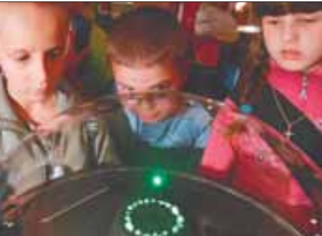
'Super' mineral ... Serbian children examine the mineral, discovered recently in Serbia that contains the same elements described in the fictional kryptonite used by the enemies of comic-book and film superhero Superman, exposed under green light in a Belgrade museum last week. Mineralogist Chris Stanley of London's Natural History Museum announced last month that the mineral, named jadarite after the Serb region where it had been found, contains the same elements as the famous crystal that weakens the power of Superman.

Fact file P ARTICLE physics is the branch of science that studies the elementary particles and forces inside atoms. The so-called "Standard Model" includes protons, neutrons, electrons, quarks, hadrons, bosons, neutrinos and a flock of other units that can be detected only at extremely high energies. Particle physics underlies other disciplines, such as nuclear physics (nuclear energy; atom bombs), astrophysics (stars, galaxies), solid-state physics (magnets, electronics, optics), and materials physics (metals, plastics, crystals).