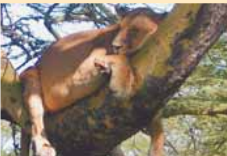
A lioness rests on a tree at the Nakuru National Park, about 120km west of Kenya's capital Nairobi. Right: Flamingoes wade in the waters of Lake Nakuru.

Tempelhof Airport, one of the world's biggest building terminals, whose arc-shaped hangars were designed in the 1930s to resemble an eagle in flight, also possesses a huge web of underground bunkers, in addition to a Nazi-designed aircraft assembly line running four miles beneath the surface. In the year 2000, a Nazi archive with files on 4,000 people forced into slave labour during the Third Reich was found in one of its bunkers. In 2008, the Berlin city government intends to close down the terminal which also is a state-protected building. - DPA