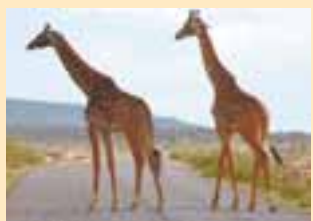
A 2006 file photo shows giraffes crossing the road in the Maasai Mara National Reserve.

From Beijing to Baltimore, US travel warnings, print and radio campaigns are selling the attractions of parks like Nakuru, nestled in the Great Rift Valley, ringed by acacia