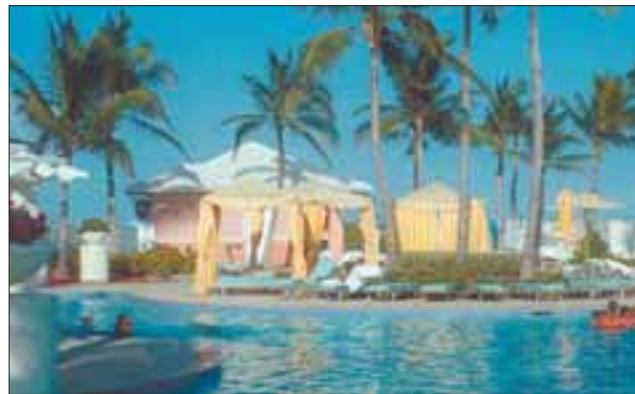
Top: One of the beaches on Little Exuma. Above: Poolside view of the Four Seasons hotel.