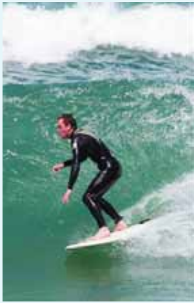
A British surfer rides a wave on a surfboard in north Cornwall.

Wave Hub's backers say the installation will also generate up to 20MW of