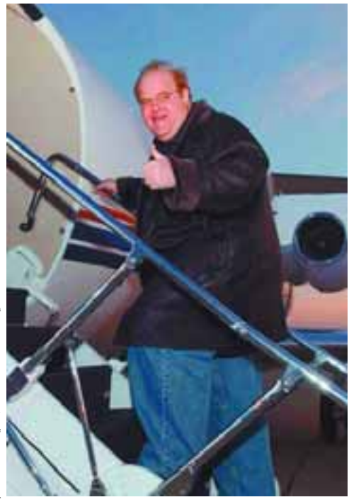
Lou Pearlman boards his private jet for a publicity trip to Atlanta, Georgia to promote his book and his new boy-band, Natural in this 2003 file photo... fading glory.

In 2002, the state dismissed the child-labour complaints, concluding in a report that the boys were contractors, so Trans Continental "is not subject to the