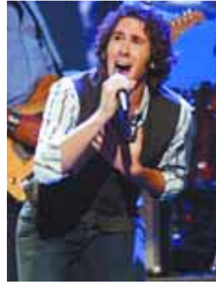
Josh Groban ... solid career start.

Clark Kent couldn't have said it any better.