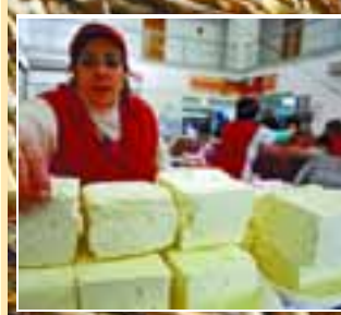
A lamb sleeps at a sheepfold in Bucharest. Romanian shepherds, have until July to meet EU rules or be banned from selling their products. Inset: A woman arranges a piece of traditional Romanian cheese at Obor market in Bucharest.

S ERBAN Enescu is wondering how to bring milk coolers 1,500m up the Carpathian mountains to a sheepfold at the end of a rocky trail unreachable by car. His weatherbeaten face creases up as the Romanian shepherd ponders new food safety standards required by the European Union (EU), which Romania joined at the start of this year.