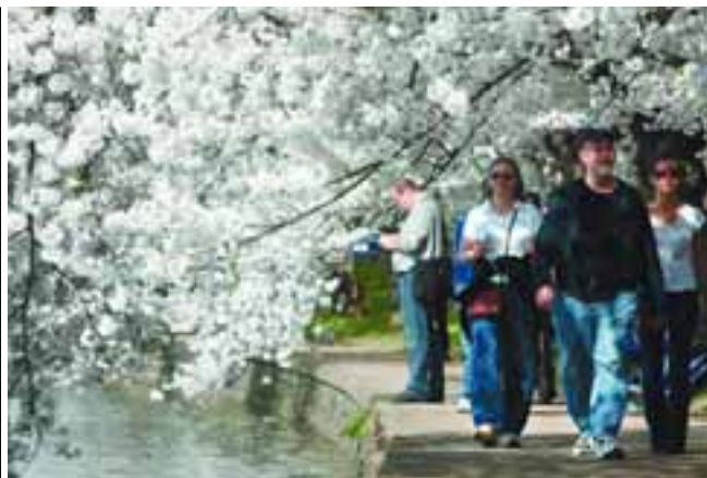
April bloom ... Visitors walk around the tidal basin during the annual Cherry Blossom Festival in Washington DC. According to the National Park Service, the trees are at the peak of their Spring bloom this month.

It all depends if the heavy rain comes, whether the whole system will fill. The brave are not waiting. Wright tells of taking parties out over the expanse of the lake to watch the waters flooding through from the north. It's a truly magnificent sight. – DPA