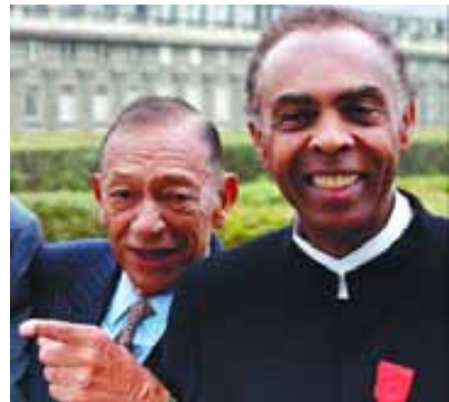
Brazil's Culture Minister and singer Gilberto Gil seen with French singer Henri Salvador on the terrace of the French culture ministry in Paris in a 2005 file photo (above), and Gil in concert at the ancient Herodus Atticus open-air theatre in Athens, Greece (left) ... 'Once I was the stone-thrower, now I am the glass.'

GILBERTO Gil has a quietly intense energy. The elegant pioneer of Brazilian song and gentle politician pulls his hair back in a ponytail, keeping the vestige of 1960s rebellion discreetly maintained. His long, tapered fingers strum the air as he speaks. The Brazilian minister of culture would seem to be a model of diplomacy. But beneath the Zen surface lies a postcolonial lion.