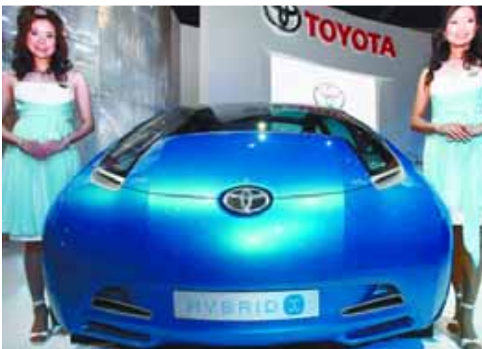
Hot wheels... Models present the Toyota concept car 'Hybrid' at the 28th Bangkok International Motor Show in Thailand. More than 300 companies, including 25 auto brands, are taking part in this year's show (March 30-April 8).