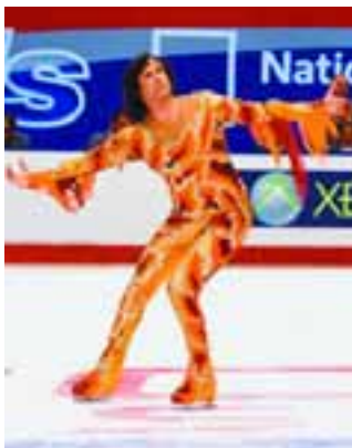
Will Ferrell stars as Chazz Michael Michaels in Blades of Glory .