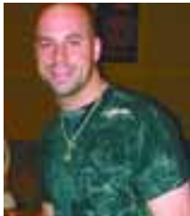
Chris Daughtry: still a long way to go

Star show hoping to become the new INXS lead singer. But my ambitions had changed since that time. As much as I love Fuel's music and felt enormously flattered to be asked, I knew joining them wasn't the right move for me." He decided to stand or fall with his own work. Chris wrote or co-wrote all but one song on his self-titled debut album. But he has never seen himself as a solo artist and always intended to form his own band. "Everything had to be done quickly to take advantage of the publicity from American Idol . That meant using some brilliant session musicians to play on my album." Daughtry's live performances gave fans the opportunity to hear tracks from the forthcoming album. So great was the anticipation that Daughtry debuted at No 2 last November on Billboard 's Hot 200. It subsequently rose to the top spot and has now been certified double platinum. Lead single, It's Not Over , peaked at No 4 and is still in the US Top 10. It has now been joined on Billboard 's Hot 100 by the second single, Home .