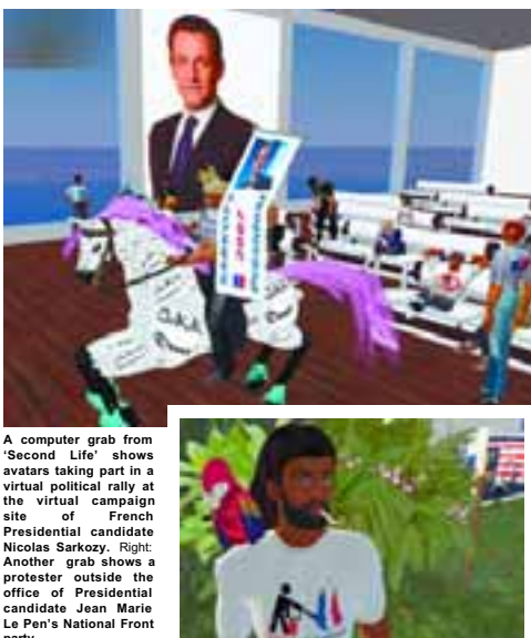
A computer grab from 'Second Life' shows avatars taking part in a virtual political rally at the virtual campaign site of French presidential candidate Nicolas Sarkozy. Right: Another grab shows a protester outside the office of Presidential candidate Jean Marie Le Pen's National Front party.