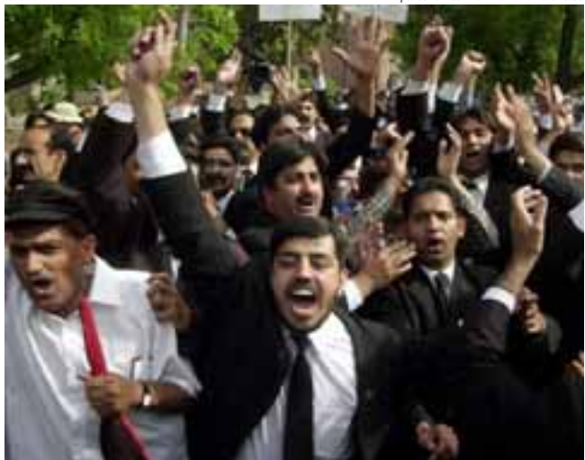
Lawyers and supporters of opposition parties Alliance for Restoration of Democracy (ARD) shout anti-government slogans outside the High Court during a protest against the suspension of Pakistan's top judge in Lahore last week. The protests were held as part of the 'Save the Judiciary campaign' following the removal of Chief Justice Iftikhar Mohamed Chaudhry by President Musharraf for alleged abuse of office.