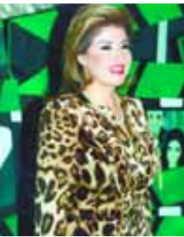
Dr Hala Sarhan ... in hot water

THE woman known as the 'Oprah Winfrey of the Middle East' has fled to London in fear for her safety amid a row over allegations that actresses were paid to pretend they were prostitutes on her television show. Dr Hala Sarhan is believed to have left Egypt aboard the private jet of Saudi billionaire Al-Waleed bin Talal when it became clear that the government wanted her arrested. Speaking this week, Sarhan called her accusers "b*****, creeps and liars" and vowed to meet them in court. The presenter has been charged with "aggravating public security and promoting promiscuous and licentious behaviour" but denies wrongdoing. She says that police protected the prostitutes in return for sexual favours and money. The media is dominating the Egyptian media.