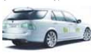
Saab will present its BioPower 100 Concept car, which runs on bioethanol, at the Geneva show. – DPA

Toyota, the market leader on hybrids, is making its European debut with the FT-HS (Future Toyota – Hybrid Sports) with "green credentials" combined with high performance. – DPA