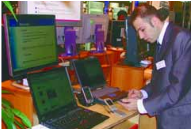
A file photo of CeBIT 2006.

Many exhibitors also hold parties at their stands - by invitation only, however. Those generally draw a close by 10pm. After all, there is also much preparation to be done for the next morning. Not least for the army of janitorial staff, who bring the halls back into tip-top form for the next day's wave of visitors. - DPA