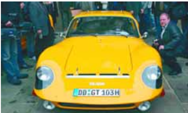
The media examine the new Melkus RS 1000 in Dresden. Only 15 of the legendary cars are to be made this time.

D ARINGLY designed and once referred to as the "Ferrari of the East" the low-slung, wing-doored Melkus RS 1000 sports car was a proud and popular speedster during the communist era.