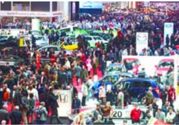
The show was a huge success in 2006. The number of visitors is expected to be more this year.

Around 250 exhibitors from 30 countries are expected to participate in Geneva – the first big show of the season, writes MARTIN BENSLEY