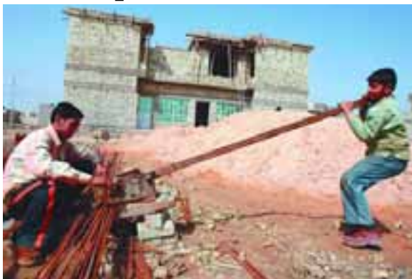
Iraqi youths work at a construction site in Baghdad. A US government audit pulled no punches in a report last month in which it said reconstruction efforts in Iraq are hampered by widespread violence, corruption and bureaucratic snarls.

shoot at the workers. It is a challenge to even get to the sites often times. Around 800 civilians working under contract to the Pentagon have been killed in Iraq since the reconstruction process began after the US-led invasion of March 2003, according to official US figures. Most of these are Iraqis but scores of foreigners have been kidnapped and are either still missing or their bodies have been found - some decapitated. According to David, some new buildings are destroyed by insurgents as fast as they are built. But if the reconstruction programme is beset by problems, it is also awash with cash. The US had by October last year poured in about $29bn (21bn euros) for Iraqi reconstruction and stabilisation efforts, according to the Government Accountability Office. Bush says he wants Congress to approve another $1.2bn to help rebuild Iraq while the Iraqi government says it will this year add a further $10bn of its own funds. The pay packets can be huge, with some contractors making $100,000 a year or more. Which is why David and thousands like him keep coming back even as some of the bigger concerns, such as US engineering giant Bechtel, pack it in. "Yes I've had enough. I want to go somewhere peaceful," says David, trying to look convincing. "I'll just see out this contract and then for sure I'll be gone. And won't be coming back. Ever. I mean it." - AFP