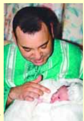
A photograph released on Thursday by the Moroccan Royal Palace shows King Mohamed VI of Morocco with his second child, newborn Princess Lalla Khadija.

Arab world, according to analysts in Rabat. The government has, for instance, reformed family law, raising the age of marriage for women, making polygamy almost impossible and improving the rights of women in situations of divorce. For weeks already, Morocco had been preparing for the birth of the royal baby. Streets were decorated with flags, lanterns, and flowers, and pavements were repaired in the capital Rabat. Celebrations are to include the slaughter of sheep, prayers, banquets and music over several days throughout the kingdom. In the coming days, Moroccans also expect to see images of the newborn with her mother. The nation never saw Mohamed's mother, but the king has modernised protocol, giving a discreet public role to his wife Lalla Salma, an engineer whom he married in 2002. The palace has also sought to reduce the aura of secrecy surrounding royal life, immediately announcing the birth of Lalla Khadija to counter rumours that she had been born days earlier. Despite the huge gap separating the elite from the poor masses in the kingdom, for change, King Mohamed has retained a certain popularity, and the birth of the new princess has been welcomed as a joyful event. The palace was skilled at protecting the king from criticism by "blaming anything negative on the government," one observer quipped. - DPA