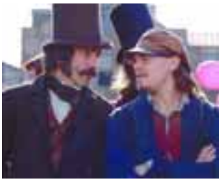
Above: Daniel Day-Lewis and Leonardo DiCaprio in Gangs of New York . Right: Martin Scorsese directs DiCaprio and Matt Damon in the Oscar-winning The Departed . Both projects were produced by Graham King.