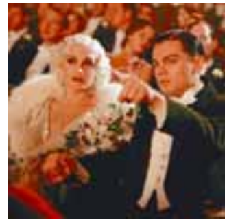
Gwen Stefani and DiCaprio in The Aviator .