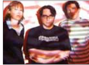
Indie-rock band Yo La Tengo

Another project the band was involved in was resurrecting The Sounds of Science , the score Yo La Tengo wrote in 2001 for eight of filmmaker Jean Painlevé's most famous underwater shorts. The band performed the score live for the first time in three years in four cities