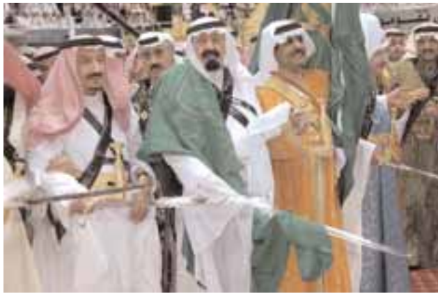
Custodian of the Two Holy Mosques King Abdullah (centre) takes part in the festivities with other royals. Right: A Saudi prince performs a traditional dance.

His Majesty Emperor Haile Selassie said spiritual and cultural education leads human beings back into unity. So that's what we're doing, he added. Reuters