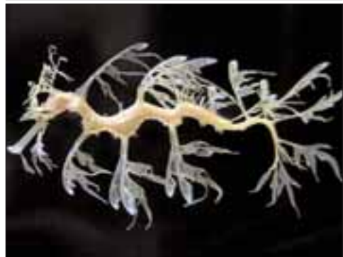
Leaves on a 'dragon' ... A leafy sea dragon ( Phycodurus equus ) obtained from Australia seen on display inside a special water tank at Seaworld Indonesia in Jakarta. The leafy sea-dragon is one of two species of sea-dragon found in Australia's southern waters. Endangered sea-dragons actually belong to the same family as sea-horses ( Syngnathidae ) but differ in appearance from the latter by possessing leaf-like appendages on their head and body and having a tail that cannot be coiled up.

Snails also know if a mucus trail is their own and can detect the sex of snails that have laid other trails. "There is absolutely no reason to suppose that this wouldn't hold true for all other species that locomote on a trail of mucus. We're only at the edge of knowing exactly what these trails are for." - Guardian News & Media