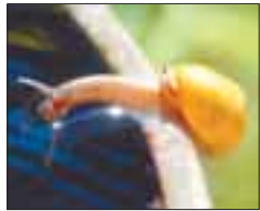
By using trails already on the ground, snails can save two-thirds of the energy they use in making fresh trails of their own.

"The energy required for them to move around is 35 times less than the energy that they expend in the mucus."