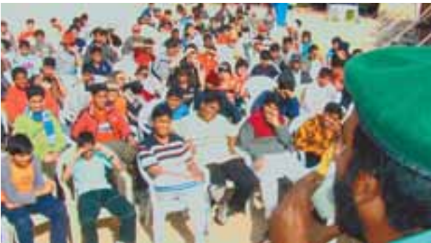
Scouts and Guides at the Shahania camp. Below: Fire extinguishing drill in progress.

The delegates chose February 22 as the date for Thinking Day because it was the birthday of Lord Baden-Powell, founder of the Boy