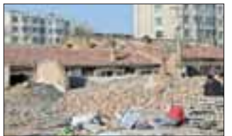
A woman picks through the remains of a demolished house in Chifeng.