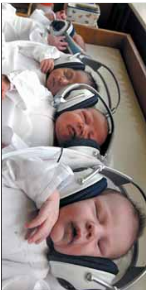
Music to the ears ... Newborns listen to music through large headphones in the maternal home of the First Nairobi Hospital in Kosice-Saca, east Slovakia. The experimental programme started four years ago and reportedly plays a vital role in the well-being of children. Mozart and Vivaldi pieces are the most popular.

Even just a strain that is not a perfect match could prevent people from dying, according to researchers at Stanford University Medical Center who are at the forefront of the effort.