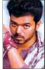
Pachaikatti! Muthucharan, Umalee Umalee, Oram Po, Deepavali, Sabari, Kuppi, Ninaitale, Latchiyam Oru Thayin Asai, Thullura Vayasu, and Adavadi.

The 10 films that failed to make it as Pongal releases are: — IANS