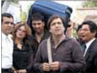
Govinda with Bhagam Bhag co-stars Paresh Rawal (left) and Akshay Kumar (back) ... truncated presence.

I went into Bhagam Bhag with eyes open, but blinkers on, says actor-politician Govinda, who's being seen on Bollywood screens after a long break