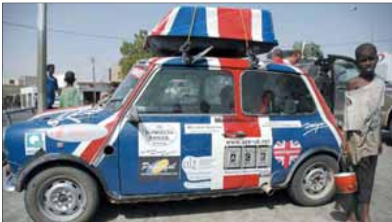
A car taking part in the Ultimate Banger Challenge stops for refuelling in the Senegalese town of Kebemer.

Sahara was this one: "Once the Rally is under way... teams are on their own. "We had to keep up a speed of at least 80kph otherwise we'd be swallowed up by the dunes, and we couldn't see more than 100m beyond our noses because we were stuck in a sandstorm," Kirkpatrick recalls. "So we were bumping off rocks and basically driving blind, just hoping not to get sprayed with sand." Spray-painted with the Union Jack, his car certainly looked the part, but its ventilation system left much to be desired. "These cars overheat in cold England so imagine what happens when you're crossing Africa! We were expecting it to blow up at any moment but thankfully we made it,"