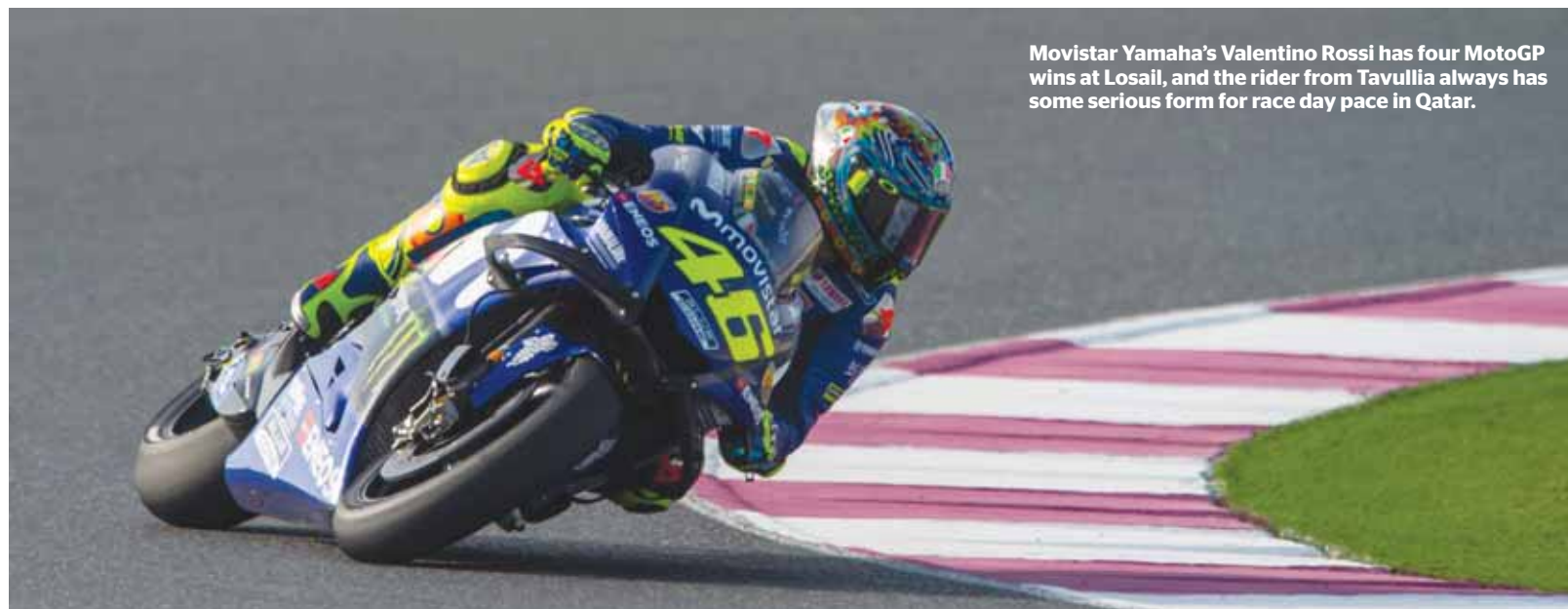
Movistar Yamaha's Valentino Rossi has four MotoGP wins at Losail, and the rider from Tavullia always has some serious form for race day pace in Qatar.

The MotoGP Free Practice begins at 2:45pm on Friday. Then when the sun goes down on Sunday, the lights go out at 7pm for the main race.