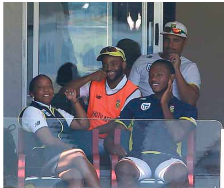
South Africa bowler Kagiso Rabada (front right) match figures of 11 for 150 – the fourth time in his 28-Test career that he had ten or more wickets in a match.

Rabada struck in the first over of the morning when he bowled Mitchell Marsh for 45 with a ball which swung in sharply. Pat Cummins fell to a sharp catch at gully by Theunis de Bruyn and Mitchell Starc edged a drive to wicket-