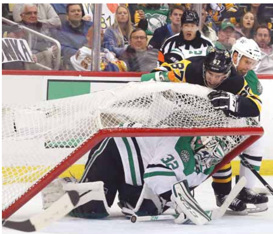
Pittsburgh Penguins center Sidney Crosby (centre) knocks the net onto Dallas Stars goaltender Kari Lehtonen as Stars defenseman Dan Hamhuis (right) defends during the second period of the NHL game in Pittsburgh on Sunday.

Christopher Gibson made 50 saves to earn his first NHL victory, and Johnny Boychuk led the offensive attack with a goal and two assists as visiting New York beat Calgary. Anders Lee added two goals for the Island-