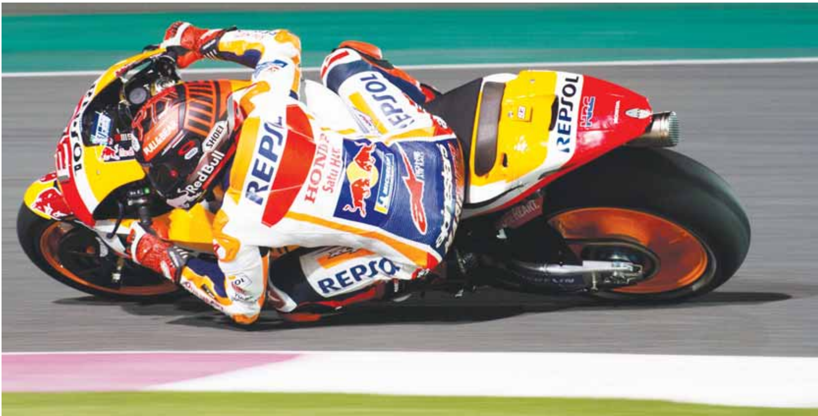
Qatar is usually a more difficult venue for reigning champion Marc Marquez and Honda, and will be keen to begin another title defence on the offensive.

The 2018 MotoGP season is nearly here, with Round One to be held at the Grand Prix of Qatar this Friday till Sunday. Ten years have passed since Losail International Circuit hosted the first floodlit MotoGP race. In that time, much has changed but the core of the sport has remained the same.