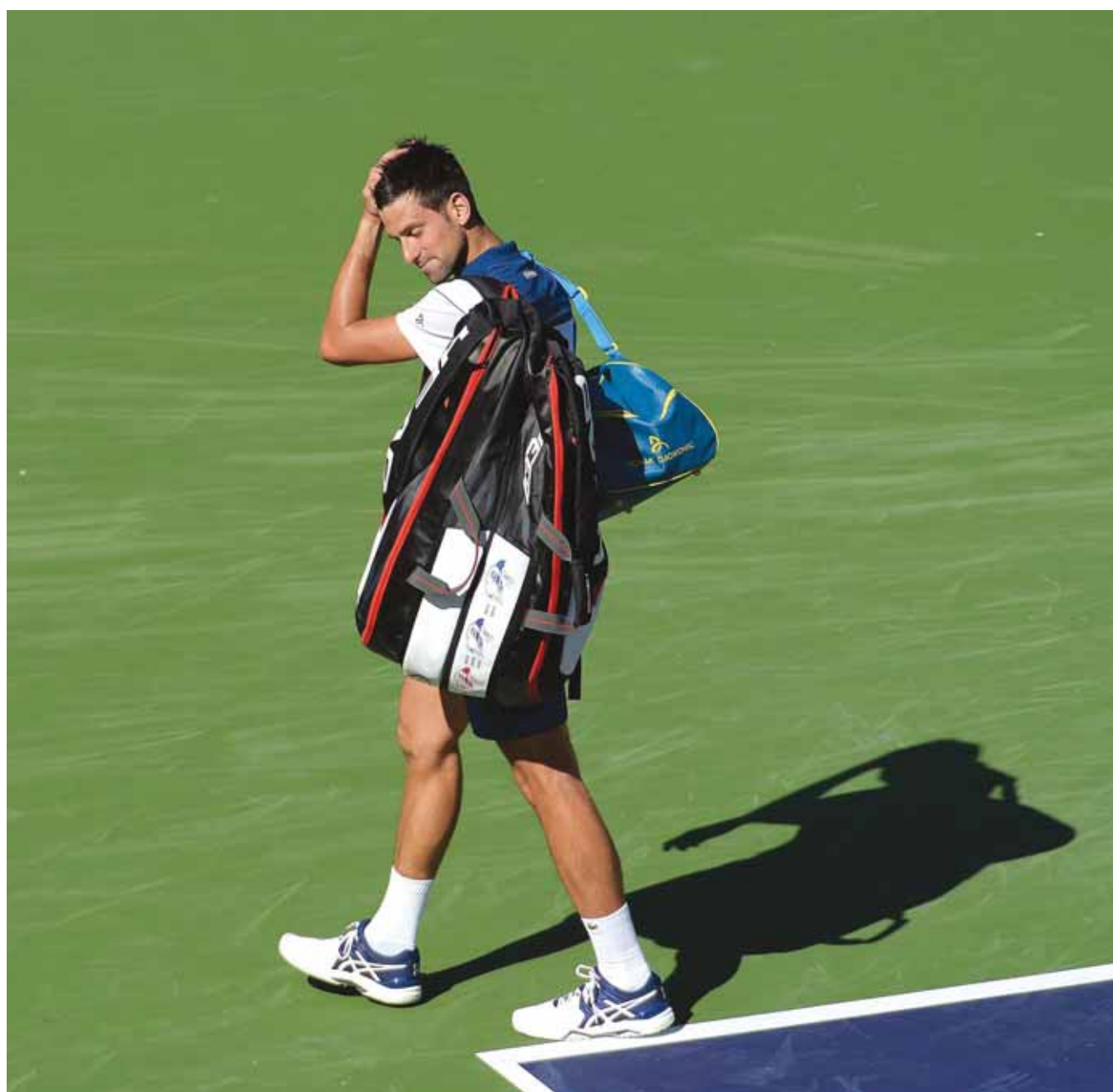
Novak Djokovic of Serbia walks off the court dejected after losing his match to Taro Daniel of Japan at the BNP Paribas Open in Indian Wells, California.

Djokovic said it felt like the "first match I ever played on the