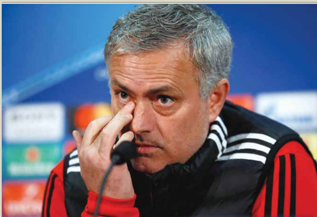
Manchester United manager Jose Mourinho during a press conference on the eve of the Champions League match against Sevilla yesterday.

Manchester United boss Jose Mourinho has labelled Frank de Boer the 'worst manager in the history of the Premier League' after the Dutchman criticised his handling of young England striker Marcus Rashford. De Boer, who lasted only 77 days as Crystal Palace manager after losing his first four league games in charge with no goals scored, said in an interview on BT Sport that it was "a pity" Mourinho was Rashford's manager because he was not getting enough chances. Rashford, 20, has been on the bench 15 times in the league this season but scored twice to secure a 2-1 victory over Liver-