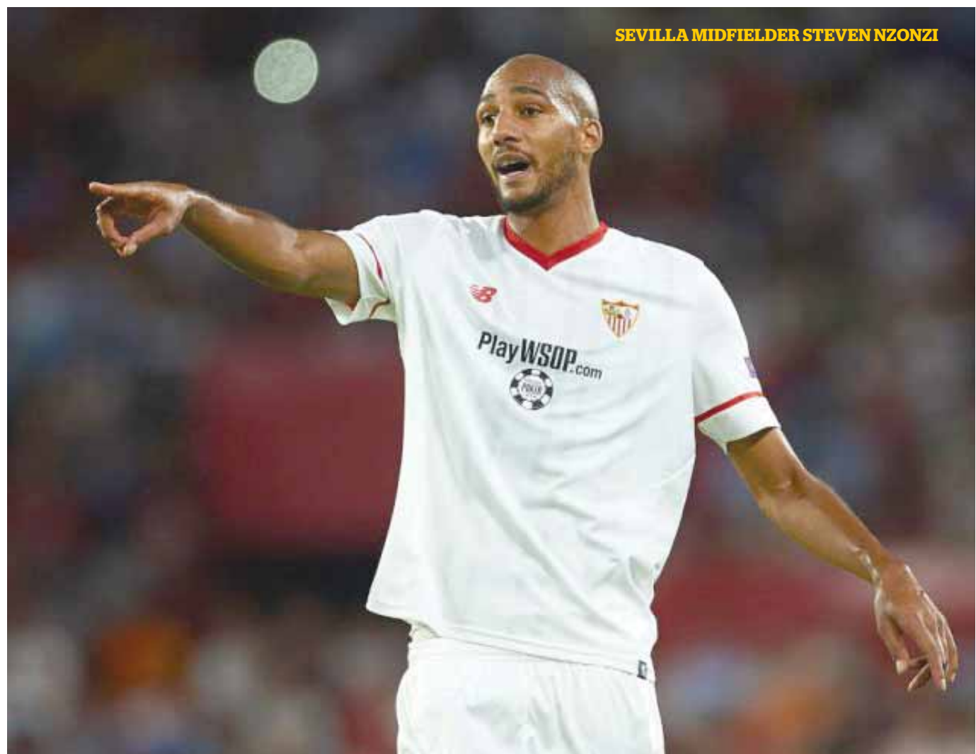
SEVILLA MIDFIELDER STEVEN NZONZI

"We have to forget this defeat and think about Tuesday. It can be a historic match for the club if we get into the quarter-finals," said Montella at the weekend.