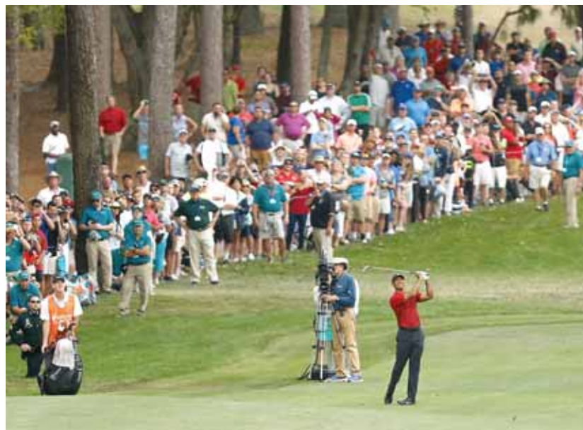
Tiger Woods plays his second shot on the 18th hole during the final round of the Valspar Championship at Innisbrook Resort Copperhead Course in Florida.

Reigning Masters champion Sergio Garcia returned to the world's top 10 thanks to a final-round 65 which saw him