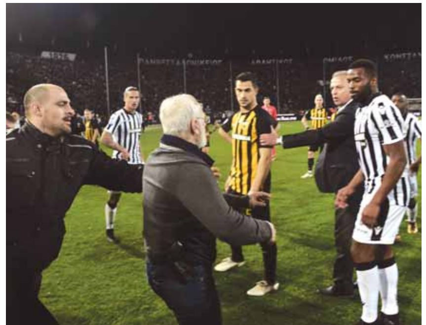
Paok Thessaloniki president Ivan Savvidis (centre) carrying a handgun in his waistband to the pitch after the referee refused a last minute goal during the Greek Superleague match between Paok Thessaloniki and AEK Athens in Thessaloniki on Sunday.

But the deal was postponed after a Russian bank backing Savvidis was placed under temporary administration. In a rare step, the US embassy in Athens later expressed concern over the issue, suggesting a lack of transparency over the funding behind the deal.