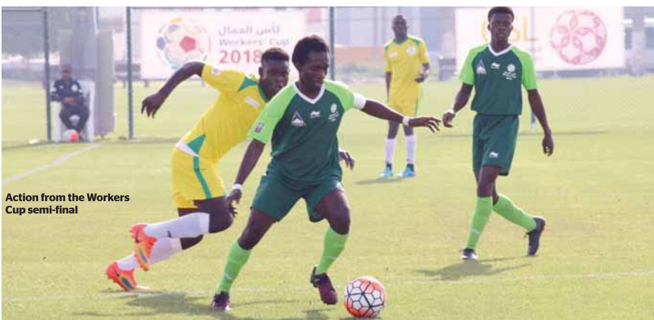
Action from the Workers Cup semi-final