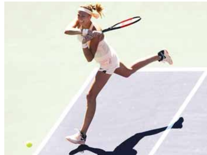
Petra Kvitova in action during her match against Amanda Anisimova at the BNP Paribas Open in Indian Wells, California.

She reached her third Grand Slam final earlier this year at