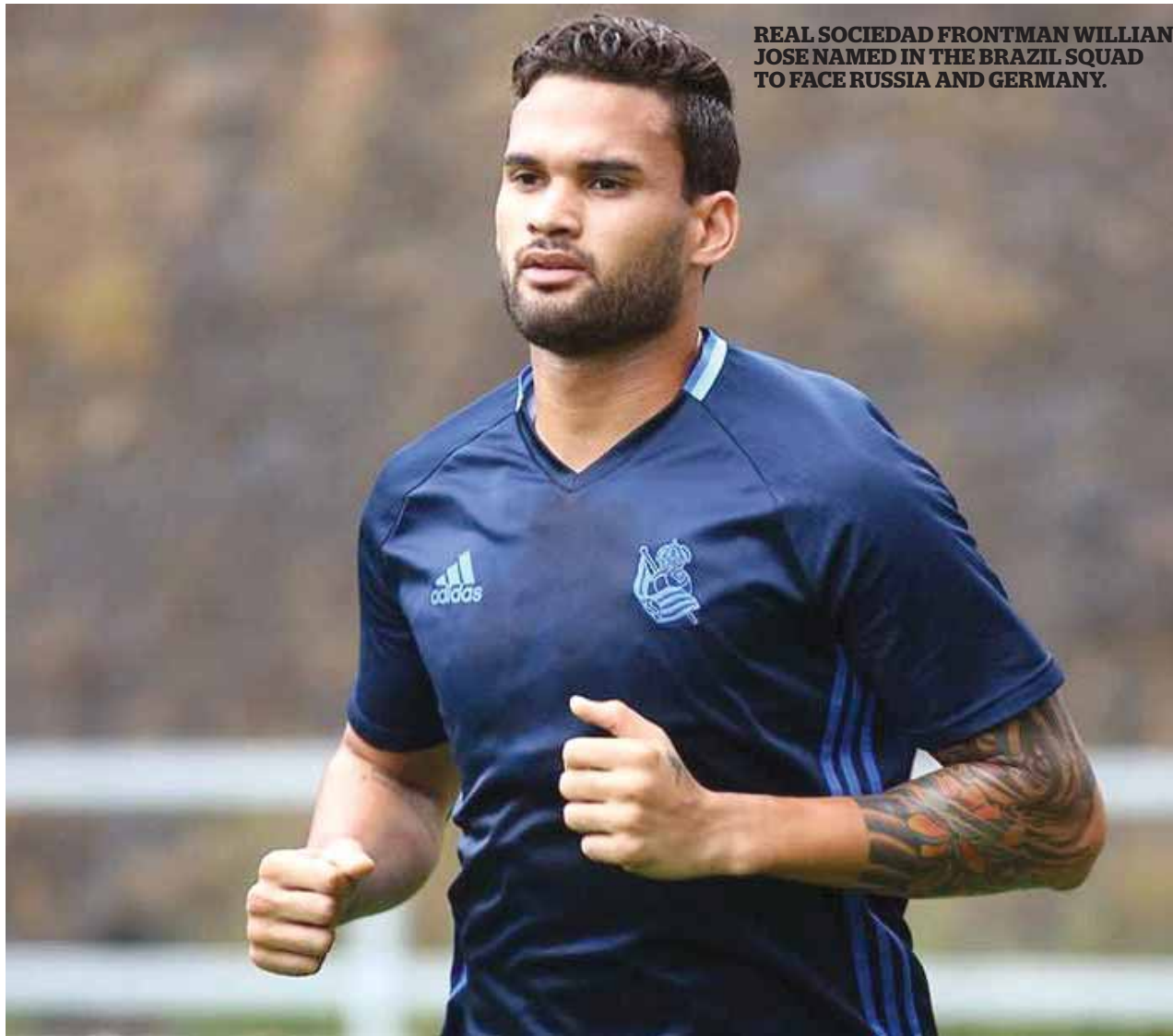
REAL SOCIEDAD FRONTMAN WILLIAN JOSE NAMED IN THE BRAZIL SQUAD TO FACE RUSSIA AND GERMANY.

Forwards: Gabriel Jesus (Manchester City/ENG), Roberto Firmino (Liverpool/ENG), Douglas Costa (Juventus/ITA), Willian Jose (Real Sociedad/ESP), Taison (Shakhtar Donetsk/UKR).