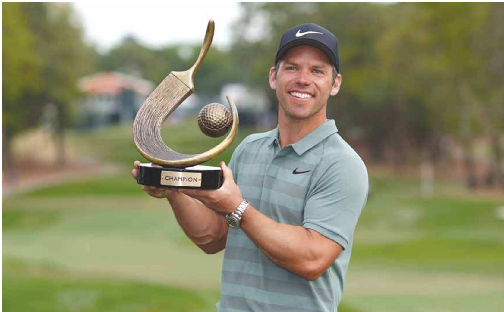
Paul Casey poses with the trophy after winning the Valspar Championship golf tournament on Sunday.

The old Tiger magic was mostly missing on Sunday as the 14-times major champion tried to record his 80th PGA Tour victory, and his first since 2013