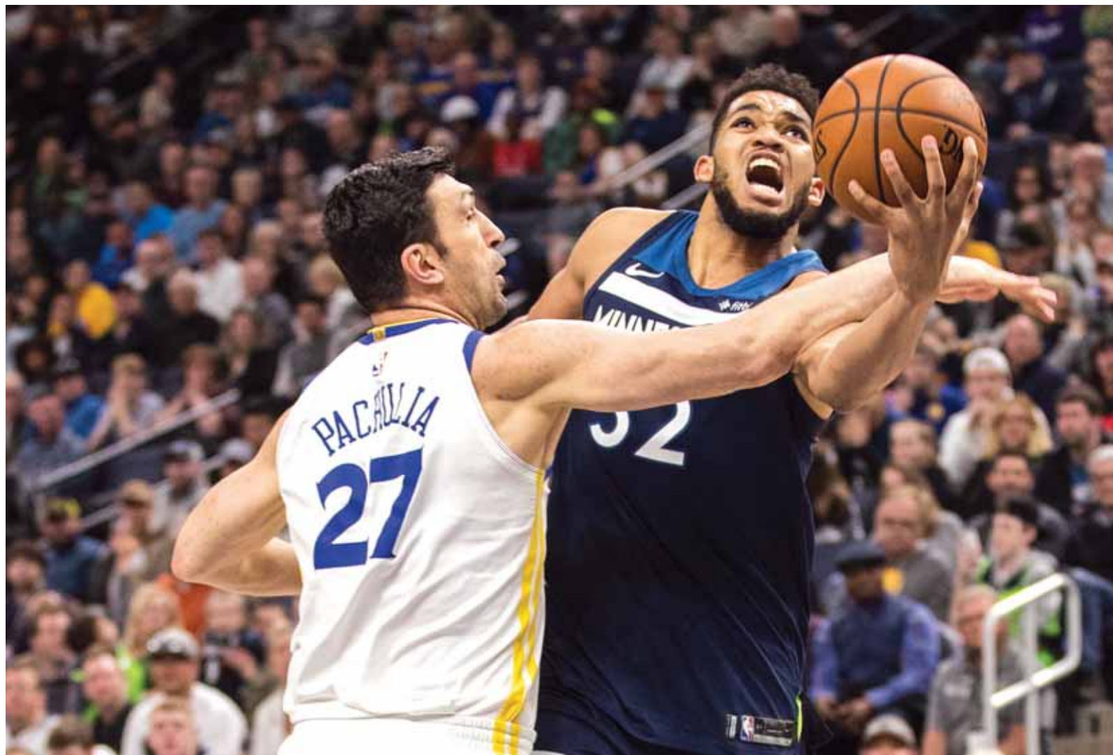
Minnesota Timberwolves center Karl-Anthony Towns (right) gets fouled by Golden State Warriors center Zaza Pachulia during the NBA match.

With MVP front-runner James Harden sidelined, Chris Paul and Eric Gordon shouldered the scoring load as visiting Houston cruised to victory over Dallas.